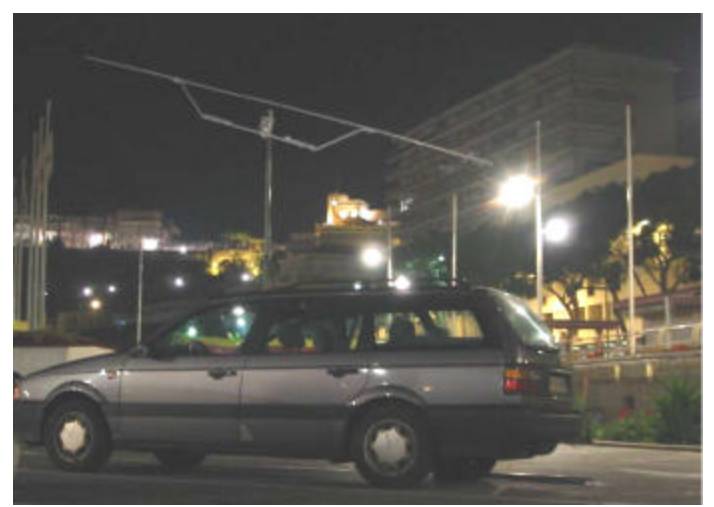
3A/DL3OCH portable on 23 cm EME in Monaco

1296 EME SSB CONTEST RESULTS: The submission deadline has come and the scores submitted tabulated. The top fun maker for 2005 goes to OE9ERC with 708 points. In second place is G4CCH with 495 points and K2UYH is third with 410 points. See the last NL for other high scores.