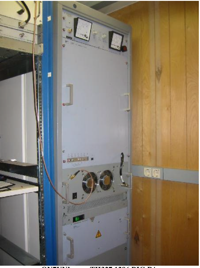
ON7UN's new TH327 1296 BIG PA