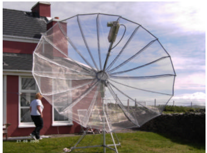
EI/DL1YMK's stress dish

during the winter, so the 'mighty ugly dish' will be ready for another event next year. It took us about 4 hours to set up the whole EME station, which is not too bad for 2 persons! The SSPA produces > 500 W and is available from DB6NT -- see end of this NL. It uses 4 PTF devices from Infineon with Anaren-hybrid couplers. I used a surplus Ericsson SPS, which I modified to give 28 V at 50 A to supply the SSPA. The autotrack is the ARS-device from EA4TX (10-bit-version). The rotator controls both were modified with a pulse width converter, so that they turned very slowly without loosing too much torque. The weak point was the backlash in the elevation unit, which is by far too weak mechanically, even for this lightweight dish. I'm not very active on the moon these days, too busy job wise. During the winter I plan to combine two of the 6NT HPA's, so my signal should improve a bit via the moon. At least on 23 cm, the tube area is over for me. I had so much trouble with my YD1336 PA that I'm happy to have a solution to that problem.