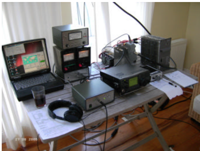
EI/DL1YMK operating position – SSPA is in upper right

Please keep the reports and technical material coming. I hope all of you can be on and have good luck operating the EME Contest. I shall be looking for you on 70 and 23 cm. 73, Al - K2UYH