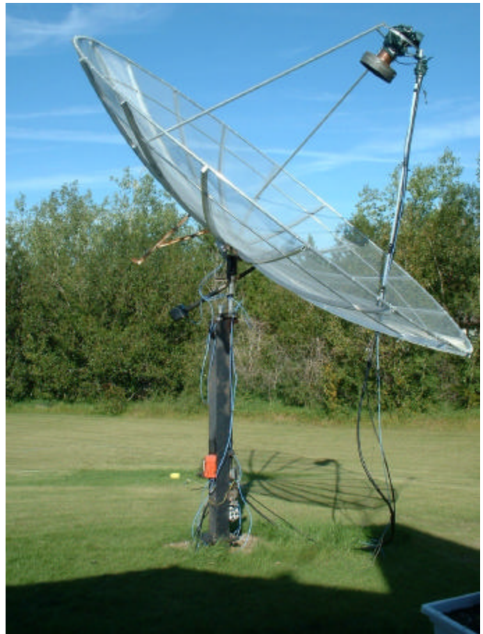
VE6TA's new dish on mount

I still am frustrated by my lack of receive sensitivity on 2320. I am contemplating a second LO for this band to simplify the issue. Dish tracking is still an issue with the larger dish, but I will continue to work on it. I plan to switch feeds to 23 after I finish my deck project. I'm looking for skeds on 13 and 23 cm.