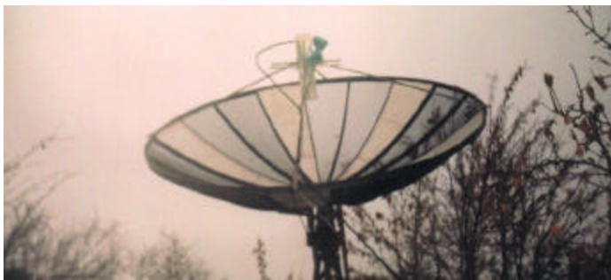
UR5LX's 3.5 m dish used on 1296 EME

SV1BTR: Jimmy's jimmyv@hol.gr contest results – I spent about 1/4 of the time I spent on 2 m on 70 cm. This was a big mistake due to lack of CW activity on 2 m. For sure 2 weekends are needed for multiband operation, as one is not enough. The Microwave EME Contest should be kept on a separate weekend as well. All my QSOs were made on random CW, unassisted – no loggers or similar aids were used. On 70 cm I worked 49 stations. I have requested that the ARRL implement separate EME contests (or weekends) for CW and digital modes with separate listings of the results.