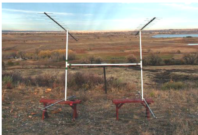
3Y0X 4 yagi array under test at W0RUN

DL0GER: Daniel dl3iae@gmx.de reports on his groups 432 operation in ARRL EME Contest -- This year's ARRL contest participation was not very successful. We could only be QRV for one day, Saturday of the second leg. The conditions were extremely good with iso-polarized signals between the Europeans for at