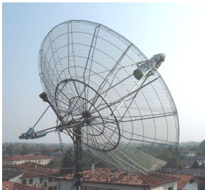
IK3COJ's new 3.8 m dish on top of his apartment building

IK3COJ: Aldo ik3coj@inwind.it has a new dish and reports on his contest activity -- After many months of hard work I have my new 3.8 m dish (0.5 f/d) in operation. I have also replaced my old VE4MA feed with a new W2IMU horn and I am now running with 300 W at the feed. I am very happy for the result of this change. On 1296 I added 12 new stations and broke the #100 initial barrier, since the new dish became operational in Sept. The ARRL Contest ended with a score of 47x28. This is my best ever result. Initials were OK1DFC #97, ON7UN #98, IW2FZR #99, LA9NEA #100, VE6TA #101, UR5LX #102, SM3LBN #103, JA6CZD #104, ES5PC #105, HA5SHF #106, W6IFE #107 and JH5LUZ #108. I CWNR VK4AFL and heard JH1KRC, VE9DW, F1ANH and PY5ZBU.