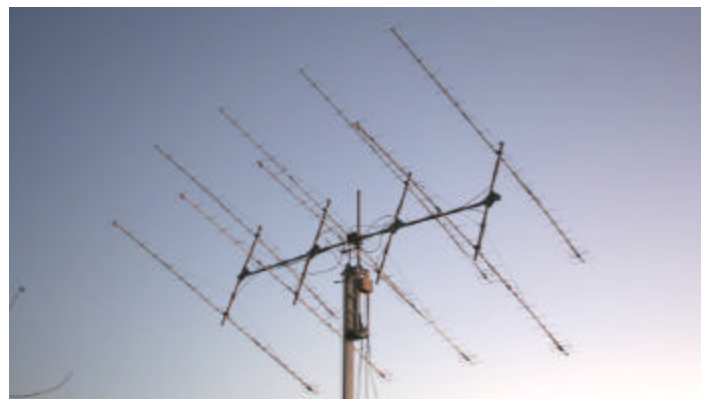
FR5DN's 8 x 21 el Tonna yagi array

FR5DN: Phil philippe.mondon5@wanadoo.fr writes on his results on 432 for the last part of the contest - I ended the contest with a total of 33x20 and an overall score of 66,000 points (assuming N9AB, K1FO, K2UYH and K0RZ are all in different states - [true]). I found conditions to be quite good on 12 Nov, but found much more fast QSB on 13 Nov. Both nights I had a polarization mismatch with Europe after 1900 and also with the NA moonrise. There were some strong signals, but they were not hearing me. This resulted in a very low QSO rate after 1900. I have been able to find a used length of flexible Heliac (FSJ4-50A). I had to clean the connectors as they were very badly corroded. It's about 1.8 m long and it will replace the length of RG213 that was ahead of my preamp. I heard echoes almost all the time during this last weekend, and sometimes surprisingly strong. Anyway after many years being off from the moon, my ears were extremely pleased to decode signals again. I am using 8x21 F9FT and a GS23B PA. Special thanks to LZ2US and SV1BTR for their help and kindness in getting back in operation!