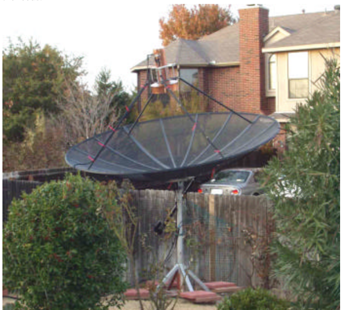
WW2R's 10' dish with 1296 feed

scalar and 3 ring scalar. He reports not seeing a great deal of difference between the feeds.