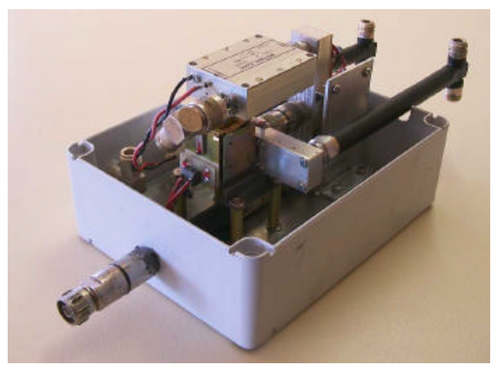
VK3UM's New feed box