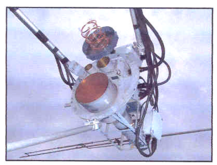
IK2 RTI's dish feeds: 3 horms are IMU circular polarized feeds for 2.3, 5.7 and 10 GHz for 4.8 m dish

TECHNICAL: A solution to problem of a light-weight circular polarized feed for 23 cm EME without the loss of a separate hybrid is presented here. It comes from IK2RTI. Such a feed is particularly desirable for use with light-weight portable dishes. Ganfanco's feed has the added advantages of easy construction and alignment. He uses this feed for 1296 EME from his hope station, with good results. It consists of two concentric left and right-hand helixes. The winding diameter is TX = 3.5 cm, RX = 2.5 cm, number of turns is TX = 3.5, RX = 4, and axial length of one turn is TX = 4.5 cm, RX = 4 cm.