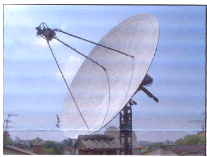
IK2RTI's 4.8 m dish made from 1.5 mm laminated Aluminum with 3 mm holes and 10 mm steps

patch feed designed by W0LMD for 1296 EME. I had only 5 dB of isolation. Of course the proof of any feed is its successful application. Ganfanco uses his slightly offset with other feeds in a 4.8\ m\ o.52\ f/d\ dish.