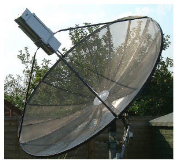
G4DDK's 2.3 m TVRO dish with 23 cm feed

G4CCH: Howard howard@g4cch.com was active on 23 cm CW during Dec-Conditions seemed very good and I was hearing my echoes with only 20 W. I worked: 9 Dec at 2009 SM3LBN (559/539), 2021 IW2FZR (569/569), 2112 K5SO (579/579), 2126 W9IIX (559/559) and 2209 K5JL (599/579). I also heard W7UPF. I QSO'd on 10 Dec at 2231 VE6TA (579/579), 2241 WW2R (559/579) for initial #219, 2331 W7BBM (55/55) on SSB and 2335 VE6TA (55/55) on SSB.