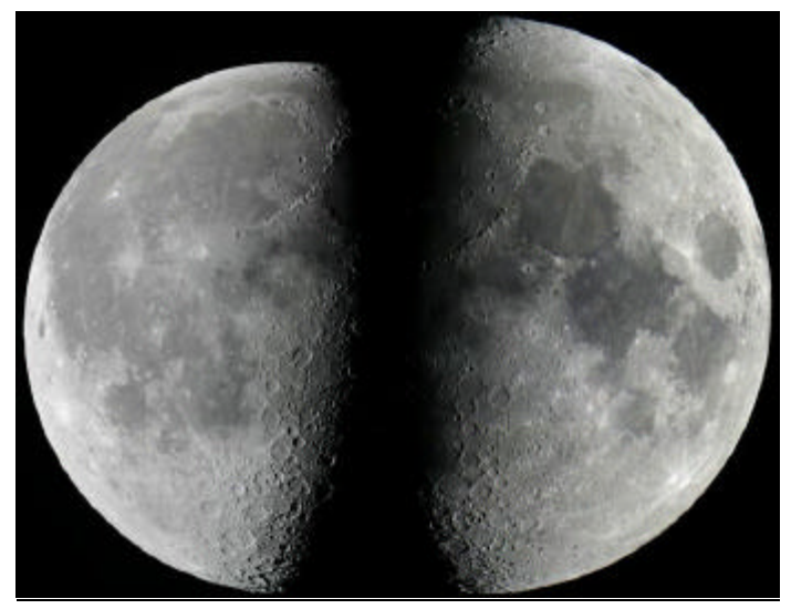
The difference between perigee and apogee

TECHNICAL: For those of you experimenting with off set dishes the following graph was developed by M0EME from using the HDL_ANT program from W1GHZ. It shows the relationship between the equivalent dish f/d ratio for which the feed (of the offset dish) should be designed, in terms of the actual f/d ratio of the reflector from which the offset dish is formed. For example if an offset dish is made from a reflector with an f/d = 0.4, the feed should be designed as if it is feeding a much shallower dish with an f/d = 0.7