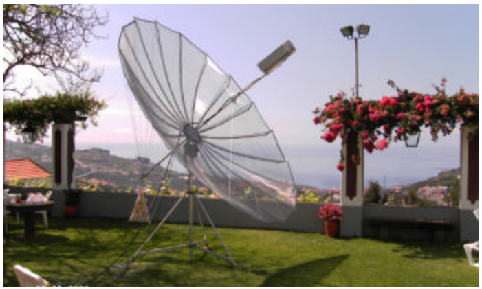
CT3/DL1YMK 4.1 m dish in Madeira