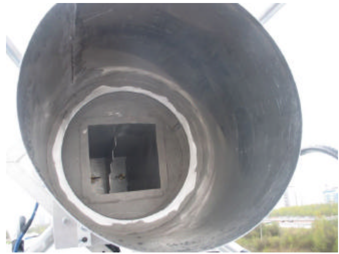
RW1AW's new 1296 dual mode Septum feed

OZ4MM: Stig vestergaard@os.dk notes the middle 10 days of May were great on EME with very good conditions and filled with dxpeditions and contests — I worked the following initials on CW: on 432 on 13 May at 0633 TF/DL1YMK (O/O) for initial #285 and DXCC 50, on 2320 on 16 May at 1317 TF/DL1YMK (O/O) for initial #63 and DXCC 24, on 1296 on 12 May at 0813 TF/DL1YMK (559/559) UFB, and in the DUBUS contest RA3EC (O/O), RW3PX (O/O), EA2LU (449/O), AD6IW (589/589), AL7RT (549/559), YO2IS (M/O) and LA8AV (559/569). During the contest I got 61 stations in the log and sill need to count the multipliers. On Sunday I heard DL3OCH as BY4RSA working JT skeds. We arranged a sked for Monday, and he was easily worked on CW with (O/O) giving me #279 initials and 54 DXCC on 1296 EME CW. Many thanks for the outstanding effort to Mikael & Monika from TF and Bodo from China.