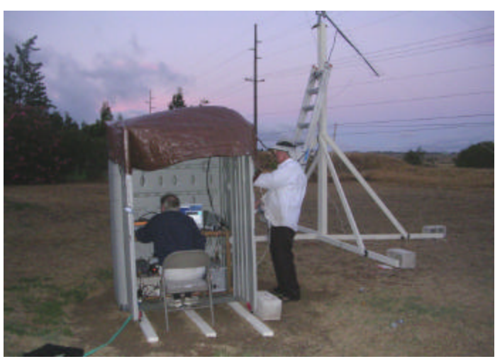
WY6G - K2UYH operating while WY6G tries to keep the shack from blowing away

DL4MEA: Günter <a href="mailto:guenter.koellner@nsn.com">guenter.koellner@nsn.com</a> sends the following thoughts on 9 cm -- The majority of the activity appears to be on 3400, so might we agree that 3400 is the primary goal of 9 cm EME? I am currently fixing problems with my 23 cm and 13 cm gear, but I have all parts at home in order to become QRV on 9 cm. As long as there are just a few now QRV, this might be a chance to create the norm. I know how complicated it is to have three bands going on EME. On 23 cm I measured 11 dB of sun noise without having the feed perfectly in the focal point. This is nearly 4 dB more than during that recent (frustrating for me) contest, so there is definitely some progress here.