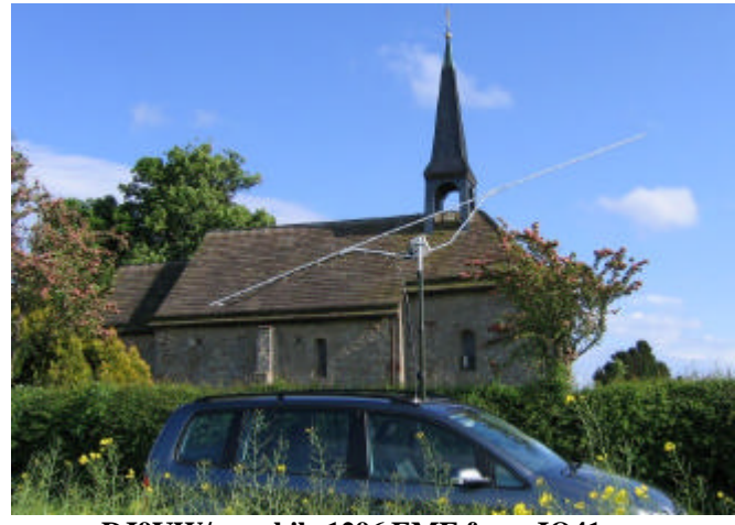
DJ9YW/p mobile 1296 EME from JO41qw