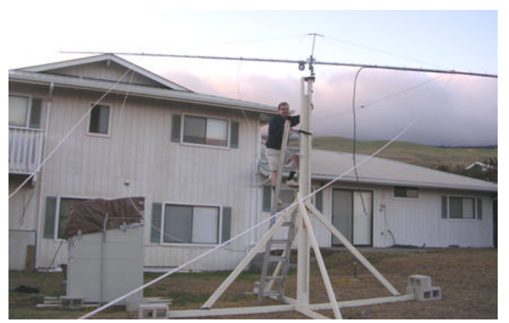
K2UYH with WY6G 13 wl yagi- operating shack is on left