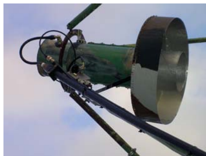
G3LTF's new super 1296 EME feed

That covers the news for this month. Please keep the reports and tech info coming. I will not be QRV during the ATP/AW on 19/20 Jan because of travel, but will be looking for you at other times off the moon. 73, AI - K2UYH