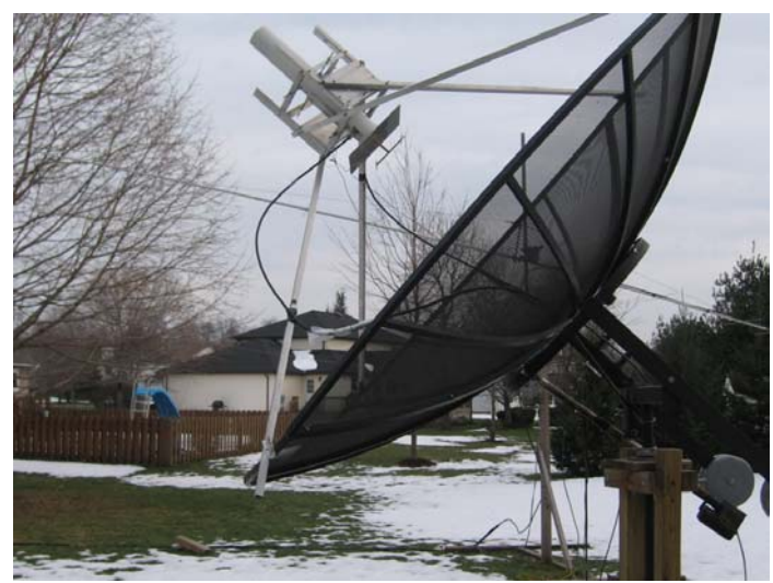
WA8RJF's dish used to make first 902 EME QSO with W5LUA in nearly 10 years. A dual dipole feed was used.

I plan to be active for the EWW/DUBUS 10 GHz (WX permitting) and the 432 EME Contests and will be looking for you all. PSE keep the reports, info and tech material coming. 73, Al-K2UYH