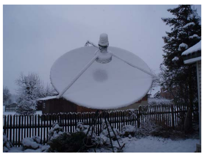
SP7DCS's 3 m dish use in the SSB Contest

SP6JLW: Andy sp6jlw@wp.pl reports that he and Jerzy, SP6OPN operated the 1296 EME SSB Contest together and achieved a score of (22x2 + 3)x11 = 517 points. They used a 6.5 m dish and 16 x BLV958 1 kW SSPA and ATF54143 LNA. QSO'd were on 7 Feb at 1432 OK1CA (53/56 JO, 1555 PI9CAM (54/58) JO, 1607 LX1DB (57/56) JN, 1631 UT5JCW (559/57) KN, 1634 ON7UN (57/57JO, 1643 JA4BLC (52/55) PM, 1650 LA9NEA (55/55) JO, 1711 OE9ERC (58/55) JN, 1740 IW2FZR (42/54) JN, 1742 DF3RU (55/56) JN, 1813 OZ4MM (58/57) JO, 1840 SV3AAF (56/55) KM, 1854 G4CCH (56/57) IO, 1914 HB9Q (58/57) JN, 1936 RW3BP (53/54) KO, 1948 GW3XYW (53/44) IO, 2046 OH2DG (53/44) KP, 2319 HB9MOON (55/55) JN and 2330 ON4BCB (54/53) JO, and on 8 Feb at 0018 K2UYH (55/57) FN, 0241 OK3RM (44/54) JN, 0245 VE6TA (55/55) DO, 0253 OZ6OL (44/54) JO, 0325 VA7MM (559/55) CN and 0401 NY2Z (559/55) FN.