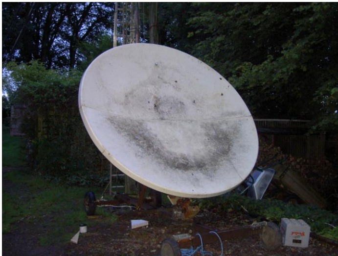
G3LTF's new 2.4 m offset dish for 3 cm EME

G4RGK: Dave g4rgk@btinternet.com was QRV on both 432 and 1296 during the ARI and ARRL 1 st Oct leg -- I worked 41 stations on 23 cm: G3LTF, OK2DL, PI9CAM, SV1BTR, IZ1BPN, LZ1US, ON4BCB, OK1KIR, HB9MOON, LA9NEA, OZ4MM, SM4IVE, G3LTF, RA3AQ, SP6JLW, DL0SHF, G4CCH, SV1BTR, WA6PY, OK1CA, OK2DL, HB9Q, PA0PLY, SV3AAF, OK1DFC, GW3XYW, SP3XPO, ES5PC, YO8BCF, GM4PMK, IK5QLO, ON4BHM, DF3RU, S59DCD, ON4BCB, IW2FZR, K1JT, LZ2US, N2UO, PA3FXB and N4PZ, but only 12 on 70 cm: OZ4MM, IINDP, UA3PTW, G3LTF, OK1DFC, DG1KJG, PA3DZL, OH2PO, SM2CEW, K1JT, K3MF and JA6AHB. I found activity and conditions were pretty rough on 70 cm and did not spend long on the band. On 16 Oct I was again was QRV on 70 cm and worked OK1DFC, DF3RU and PY1KK. And finally on 20 Oct, I was able to put CE0Y (23DB/O) in my log in straight periods. At first when they came on, their clock was around 10 secs out; once they fixed that, they were a fairly easy to work. I will not be QRV from G during the second leg as I will be in EA8 during and hope to be QRV from there with the usual equipment. Look for EA8/G4RGK on 2 m and 70 cm.