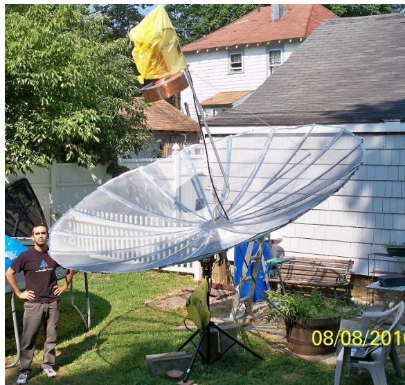
W2NNN with his 12' stress dish and 1296 feed