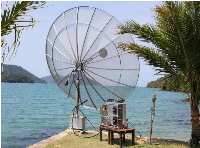
PY1KK 4 m dish and new 800 W SSPA – great location!

PY1KK: Bruce (PY2BS) bruce(x)zirok.net writes about his portable 70 cm station -- After 8 months of preparations, I'm back on 70 cm at PY1KK with improved setup. I have the same 4 m dish, but now with R&S SSPA at 800 W with feed mounted Xpol LNAs and OE5JFL auto-tracking. During the ARI contest weekend, I worked OK1DFC (JT+CW), SM4IVE (CW), OK1TEH (JT) to Matej's single yagi WAC, OZ4MM (CW), UA4AQL (JT), G4RGK (JT), EA3XU (JT), YO3DDZ (JT), DF3RU (JT), PA3DZL (JT), DL2NUD (JT) and UT6UG (JT). PY1KK will be QRV during the southern Earth summer vacation time (last third of Dec and most of Jan) and possibly some weekends before. If anyone is interested on an early try, please send an e-mail, so that I can inform you in advance when I am going there.