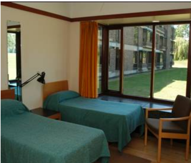
EME2012 typical room

All rooms have private bath, shower and toilet facilities and wired high speed internet access. (Bring your own Ethernet cable). Use of the Gym is free and there is free wireless high speed internet access in public areas. If you plan to bring your partner please book early as the number of twin bedded rooms is limited. I look forward to seeing you in Cambridge.