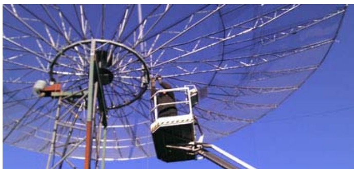
SM4IVE dish repairs

SM4IVE: Lars sm4ive(x)telia.com did not have a happy holiday – On 26 Dec server winds (24 m/sec) caused serious damage to my dish. Two ribs were damaged. I decided the best solution would be to reinforce the ribs. So I contacted a professional welder. We had good weather on 14 Jan, still -2 degs and windy so it was cold, but we were able to make the repairs to the dish structure.