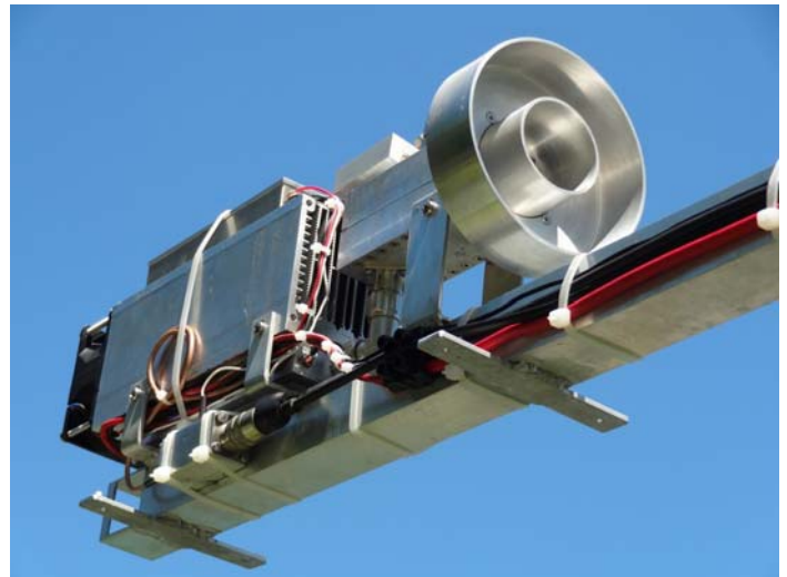
PK1KK's 6 cm feed package used for 1 st SA 6 cm WAC

is on Saturday and 1296 Sunday, and during the 70 cm CW ATP. Please try to be on for all the activity. 73, Al – K2UYH