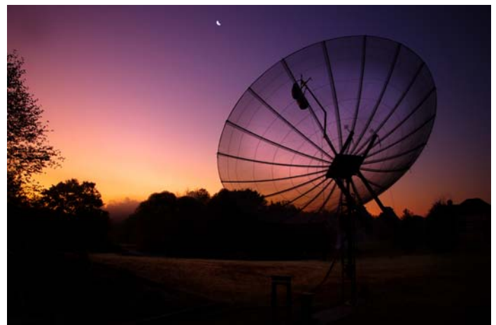
N2UO's 20' dish at sunrise