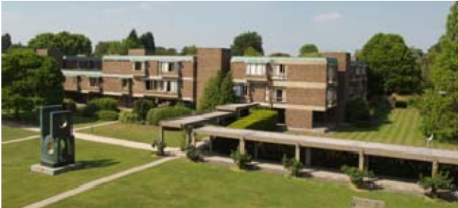
EME2012 room location

The Booking site for the 15 th International EME conference in Cambridge is now open. Go to www.eme2012.com . To achieve best value the organizers are offering a range of accommodation packages of from 2 to 4 nights. These all include day time refreshments and lunch for the delegate and Friday dinner. Additional options include a pre-conference tour, partners program and Gala Dinner. Go to the prices page to decide, which package suits you then register and book.