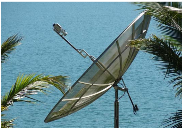
PK1KK's 4 m dish & feed used for 1 st SA 6 cm EME QSOs

PY1KK: Bruce (PY2BS) bruce(x)zirok.com reports on the first 6 cm activity South America -- I am finally on 6 cm, my 5th EME band - 432 and up. The DB6NT transverter and SSPA were mounted at the feed (a scaled version of RA3AQ "flush" design), and a G3RUH 10 MHz GPS reference and 12 V PS were located near the dish base. Power at feeder was about 50~60 W. The tracking was with an OE5JFL antenna controller. The position feedback from my encoders were not accurate enough, so, at the beginning of each session I had to find the Moon by my own echoes, and recalibrate the controller. After this, the tracking worked for a long time without needing any readjustment. Contrary to my concern, the 4 m mesh dish behaved surprisingly well at 5.7 GHz. QSOed were OK1KIR (O/O), OH2DG (549/549), OK1KIR (559/559), SP6GWN (O/O), PA7JB (O/O), G3LTF (O/O), W5LUA (569/559), LX1DB (569/569) and SSB (55/56), F2TU (559/559) and SSB (54/44), PA0BAT (549/549), ES5PC(O/O), S59DCD (539/529), G4NNS (529/529) and F1PYR(O/O). I was unable to complete with WA6PY and F2CT. Many thanks for all the nice signals, especially from Willi for a UFB voice QSO. I expect to be back on 6 cm, as well as to 9 cm, later this year, possibly on the DUBUS Microwave Contest weekends.