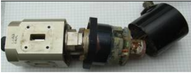
G4NNS's waveguide relay

I soon decided that the waveguide switch was a write off as it was thoroughly seized up. Fortunately a replacement was available. I thought it worth having a try at repairing the preamp and as it was Aug, I thought it would not be possible to order a replacement as Kuhne Electronic was closed.