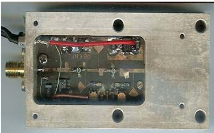
LNA after cleaning and re-work

After giving the pre-amp a good wash and dry I took it apart removing the PCB for more cleaning using de ionised water, followed by thorough drying and more cleaning using solvent. I then first checked that the bias supply was working, which after replacing a couple of capacitors, it was. The input regulator had failed as had the protection Zenar diodes. These were replaced. Fortunately the bias adjustment pots seemed to be OK. Next the GaAs FETs were replaced and their bias set so that the drain voltage was about 2 V. Meanwhile the Aluminium housing had been thoroughly cleaned including immersion in caustic soda and then polished as well as I could using a multi tool with wire brush etc. The PCB was replaced into the housing using conducting paint (as used for repairing heated windscreens) to ensure a good contact with the housing. A new socket and feed through capacitor were fitted.