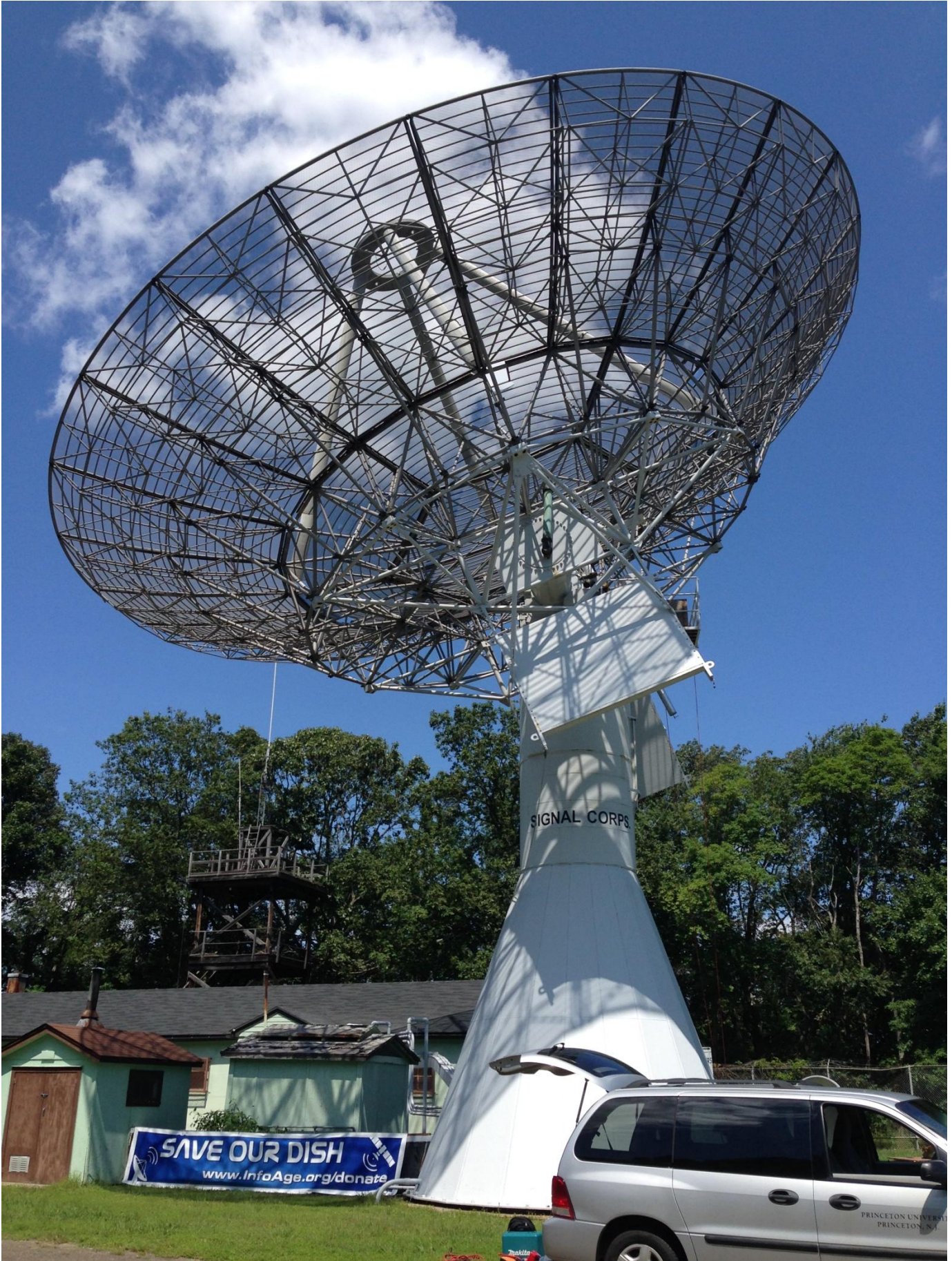
N2MO 60' Dish