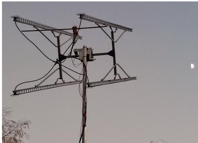
G4BRK 4 x 55 el yagi array

what I expected to work with a yagi system. I worked a number of other initials outside the contest, even got one decode from a single yagi station DJ2DY! My total is now at initial #7 on CW and on JT65C {#39}. Best of all I had a great time!