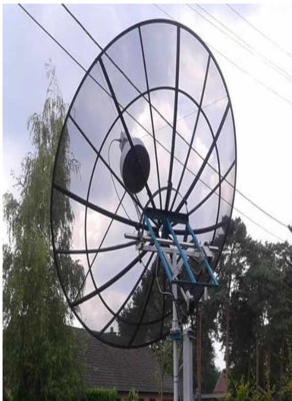
ON5GS's 3 m dish with 1296 feed

ON5GS: Dirk <on5gs@telenet.be> in (JO21SC) is new to 23 cm EME and had his first QSO in May – I had my best EME weekend ever during the recent contest . Although my CW skills are relatively poor, I decided to do a CW only contest on 23 cm until my old second-hand FT736 broke down just after working SM4IVE and my power was gone. My station is 3 m dish with L/R circular septum feed, a 200 W PA and DDK LNA. The dish moves automatically with a VK5DJ tracking system and 2 HH-12 encoders. HSDR proved to be a VERY useful tool while searching for stations. I used an old transverter (1296 to 146) and a 20 Eu RTL dongle for reception. In my log are I1NDP, G4CCH, OE5JFL, OK1DFC, OK2DL, SP6JLW, G3LTF, DL6SH, OZ6OL, DL3EBJ, OK1CS, SP6ITF, F5SE/p, PA3DZL, PA3CQE, LX1DB, NC1I and SM4IVE. I especially cut one big tree, which blocked my east view for JA, but worked only one station outside of EU, NC1I. I5MPK kept on calling me ON6OU; I was very sorry to miss this QSO. I also CWNR S53MM for a long time. Heard were SV3AAF and K1JT. My best QSO was PA3CQE; 3 m to 3 m dishes, 40 km distance (JO21-JO21) QSO via EME!