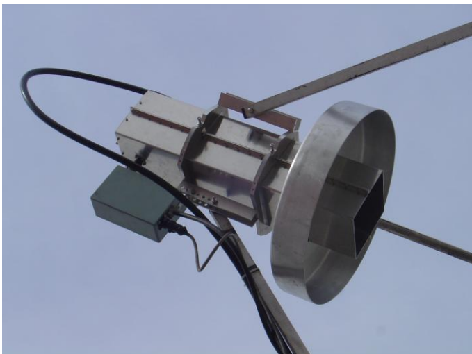
XE1XA's rectangular 1296 septum horn feed with added scalar ring – see details above

square feeder, so that I slide and remove it in a few minutes to make comparative measurements. Max's dish f/d is 0.39].