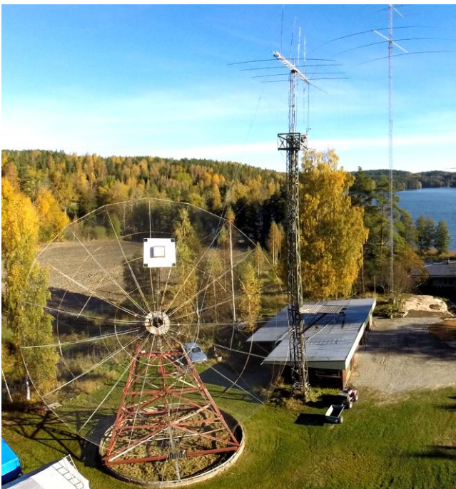
OH2PO 16 m dish with 10 m base scored 106x38 on 432

23/70 CM EME SSB FUNTEST RULES: These events are intended to be fun. You do not need to transmit on SSB to participate. CW to SSB and vice versa exchanges are encouraged and count for points. (Only one QSO between stations is allowed, i.e., you cannot work a station SSB to SSB and SSB to CW for extra points). The 70 cm contest is from 0000 Saturday 16 Jan to 2359 16 Jan. The 23 cm contest is from 0000 Sunday 17 Jan to 2359 17 Jan. These are two separate contests. Everyone one should have one Moon pass. Scoring is contact points x number of two letter Grid Sectors (IO, JM, FN, EM ...) worked. SSB to SSB contacts count as 2 points. SSB to CW (or CW to SSB) count as 1 point. The exchange is your Sector (IO, JM, etc.). Only the 2 sector letters need to be sent and copied by EME. The exchange of signal reports and/or 4 character grids is optional and not required. Operation may be by single or multiple operators from one location. No distinction for scoring will be made. Assisted operation is not encouraged. All skeds/operational announcements should be made prior to the start of the contest. Logs should be sent to the 432 and Up EME NL by email to alkatz@tcnj.edu ASAP after the end of the contests. (All logs for contest awards should have been received within the month following the contest). The top scoring station on each band will receive an attractively framed certificate that will be presented at the next International EME Conference (Venice 2016).