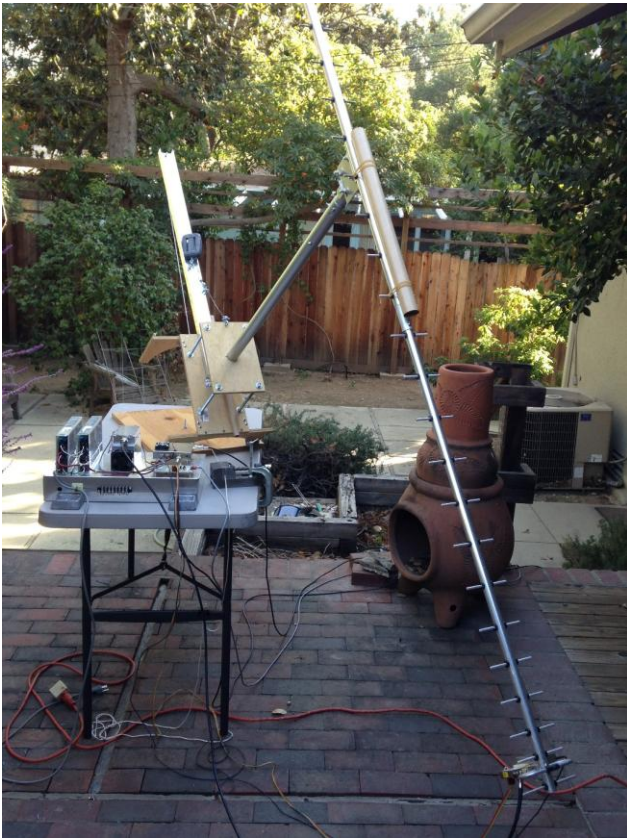
KI6ICF's polar mounted 1296 yagi

KB7Q: Gene geneshea@gmail.com sends his progress report on plans to put KH6/KB7Q on 432 EME in Feb -- A borrowed 432 transceiver is in hand, the LDMOS amp is done and putting out an honest 500 W after replacing a shorted by-pass capacitor, and the GasFET pre-amp is mounted in the relay box. The 9 wl yagi I plan to use in HI recently arrived, and was used on 18-20 Dec to put MT on 432 EME before I boxed it up and sent it off to Hawaii. I set the yagi up on the front long and tested the 432 gear. Over 3 days, in spite of having a tree just 5' off the end of the yagi, I worked 10 stations on JT65B and one on CW: DL5FN, K5DOG, HB9Q, UA3PTW, DL7APV, NC1I, DK3WG, DF3RU, K2UYH, DL9KR (CW) and UT6UG. So it was a decent test. The 500 W W6PQL amp was rock solid. [See following dxpedition announcement].