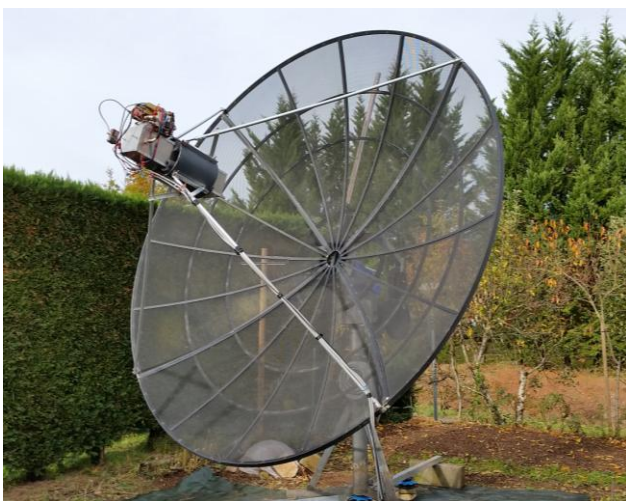
F6ETI's 3 m dish and 1296 feed

F6ETI: Philippe f6eti@wanadoo.fr is now QRV on 1296 CW with a 3 m dish, 100 W and 0.6 dB NF LNA -- I am really pleased with my QSOs. The signals have not all been strong. I still have some way to go. I am using an old F1ANH preamp that I used in 2001. I will soon replace it with DDK VLNA. On the TX side, I plan to be at 400-500 W in a few months. I worked on 1296 random CW on 30 Oct F5SE/p, on 31 Oct F5SE/p again, on 1 Nov RA3EC, PI9CAM, I1NDP, SP6JLW, OK2DL, SM4IVE, OE5JFL and G3LTF, on 21 Nov K2UYH, on 22 Nov G4CCH, 24 Nov SM4IVE, on 25 Nov DF3RU, 28 Nov DLØSHF, DL3EBJ, DF3RU, VK3UM and IZ1BPN, and on 29 Nov OK1CS. I always hear the ONØEME beacon well.