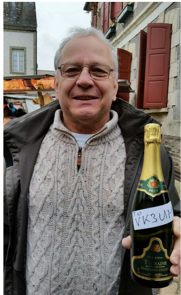
F6ETI toasts VK3UM for his FB software