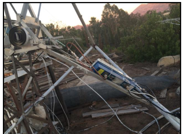
WA6PY's 6 cm feed horn and with TWT mount close by