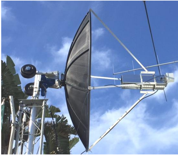
ZS6EME's 3.6 m dish is ready to go on 13 and 6 cm