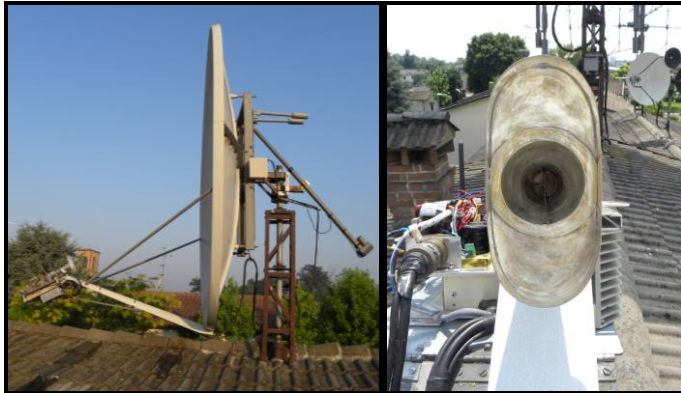
IK2RTI's 2.4 m offset dish (R) with new 6 cm feed (L)

sunnoise was 13.5 dB with 78.5 SFU and the moonnoise 1 dB. [See horn pattern at end of this NL]. I wanted to build this feed CP for 6 cm in order to add a new module on my offset dish, besides my existing 10368, 10450 and 24048 modules. I also want to re-build the feed for 10 GHz in case there is a switch from linear to CP. Unfortunately I made few QSOs compared to the other stations I heard because I had problems with my old transverter's LO and had to quite early. The stations worked on 3 July were SM6FHZ, G3LTF, DF3RU, UA3PTW, OK1KIR, OH2DG and ES5PC. I am QRV in 24 GHz, my last QSOs were on 20 Jan with JA1WQF (O/O) and JA6CZD (559/O).