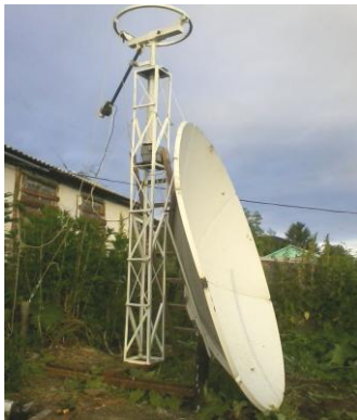
RW0LDF's new 2.4 m dish ready to be put in place

NET/REFLECTOR NEWS: KL6M burned out his elevation motor and missed the 6 cm contest, but is QRV again and giving out 6 cm QSOs. RW0LDF has a new dish mount and has a new 2.4 m dish on top. He plans to increase the diameter of this dish to 3.4 m shortly. Serge is available for 23 cm skeds at rw0ldf@mail.ru .