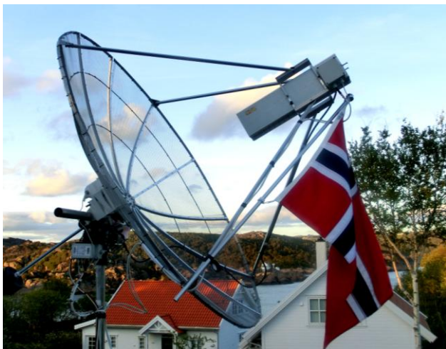
LA3EQ's 1.9 m dish

LA3EQ: Jan j-lustru@online.no is a new station on 1296 EME -- My setup is 1.9 m mesh dish with a septum feed, 140 W SSPA, G4DDK LNA and TS2000X. My rotor is a Spid Ras HR. I started up this year and now have mixed initial #49 on 23 cm EME. Most are on JT65C but I also have a few in CW QSOs. I am looking for skeds.