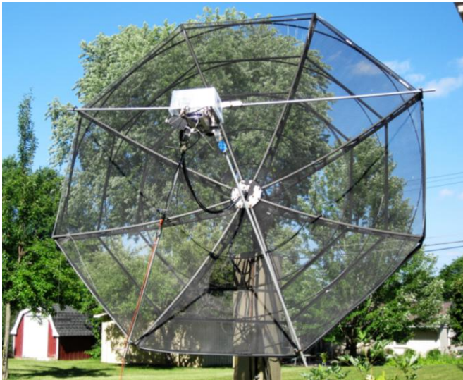
WA9FWD is now QRV on 6 cm EME from Wisc

CONDITIONS: Summer is finally here with no up coming contests, but there is still plenty to keep things (EME) interesting. Foremost is the 17th International EME Conference in Venice on 19 to 21 Aug – see the end of this newsletter (NL) for more details. You really do not want to miss it, and there is still time to attend. There was a BIG turnout for the 6 cm DUBUS/EU EME Contest. G3LTF has the highest reported score with 34x32. HB9Q also has 34 CW QSOs but writes that he was not participating not in the contest and thus not following the rules. Unfortunately lost in the 6 cm activity was the June 70 cm CW Activity Time Period (ATP). The next ATP in not until 28 Aug from 0200 to 0400 and 1000 to 1200. The activity during the 9 cm Microwave Activity Weekend (MVAW) was not that good, possibly due to bad WX in EU. The 3 cm MVAW is on 30/31 July and expected to have many more stations QRV. KB7Q/O had a very successful state dxpedition to SD in June – see Gene's report in this NL. There are no dxpeditions in July, but SP/OK5EME will be QRV on the MW EME band in Aug, and coming in Oct are dxpeditions the S9YY to Sao Tome & Principe (432) and XT2AFT to Burkina Faso (to 2300) – see reports in this NL. The logs for the DUBUS/EU Contests are due on 16 July. Please get your logs in immediately!