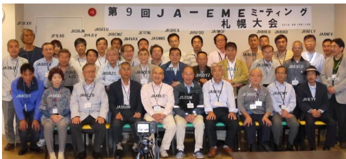
JA EME Conference in Sapporo

JA4BLC: Yoshiro ja4blc@web-sanin.co.jp writes -- I attended and very much enjoyed the 9th JA EME conference in Sapporo on 17/18 June. The conference was organized by JA8ERE, JA8IAD and JA8CMY. 43 people attended. The next JA EME conference will be held in 2019 in Kyoto. On 3 cm, I worked on 31 May JA1WQF (O/O) cross pol -JA1WQF was using linear-H pol and I was using circular, on 1 June JA6CZD (559/569) - both on circular and again JA1WQF (549/559) with cross pol, and on 4 June G4NNS (559/559) XB 10368/10450 for initial #34. On 5760, I worked JA1WQF on 27 June (559/569), on 1 July during test to check the gear for DUBUS Contest JA8ERE (579/559), VK3NX (559/559), JA6CZD (559/569), JA1WQF (559/559) and JA8IAD (549/559), during the contest OK1CA, HB9Q, SM6FHZ, UA3PTW, UA4HTS, PA0BAT, G3LTF, ES5PC, JA1WQF, JA6CZD, DF3RU, DL7YC, OH2DG, OK1KIR, VK3NX, JF3HUC, JA8ERE, JA8IAD and PA3DZL for a total of 19x17, and after on 4 July G4NNS (559/559) for initial #40. It was a pity that I heard no NA signal in the contest. My window is restricted by a house and trees to east. I need AZ>100 and EL>40. on 5760. During the DUBUS contest, six Japanese 6 cm EMEers agreed to transmit using 5 kHz separation as done in ARI and DUBUS 3 cm contest to avoid the QRM. This arrangement again worked very well.