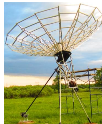
KNOWS' new 4.8 m dish under construction