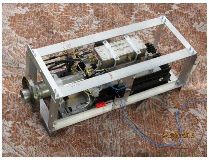
UA3TCF's 3 cm feed box

This is the pre-EME Conference issue I promised last month. We (Sally and I) are looking forward to seeing our friends in Venice. I am planning to be on the Moon a few times before we leave. Please keep the reports and tech info coming. 73, AI – K2UYH