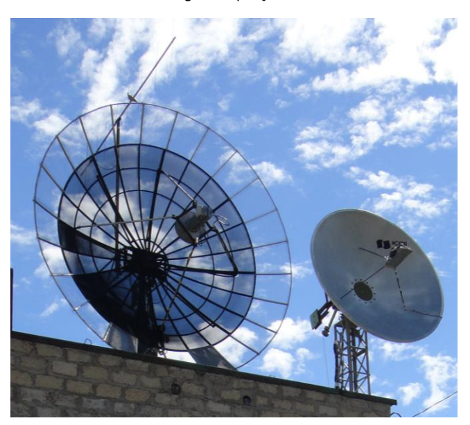
UA4AAV 4.5 and 2.5 m dishes used on 23 and 6 cm

random CW HB9Q (579/539), and with JT4F UA4HTS (12DB/15DB), UA3PTW (13DB/14DB) and OK1KIR (13DB/13DB). My current setup is a 2.5 m dish, 15 W amplifier and VK5DJ dish controller. I measure 7.7~8.0 dB of sunnoise and 0.3~0.4 dB moonnoise. On 1296 I use a 4.5 m dish. [TNX to RA4SD for forwarding this report].