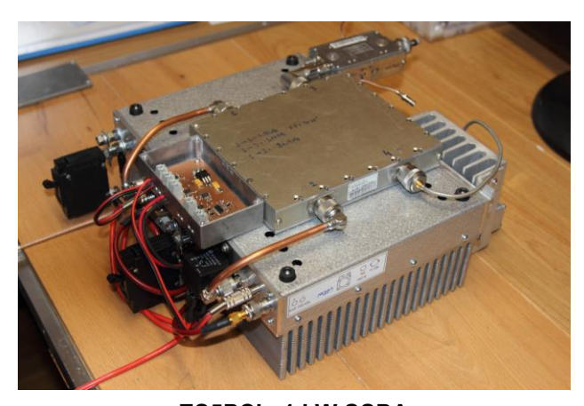
ES5PC's 1 kW SSPA

FREQUENCY BASICS: I know that there are many new comers to EME that read this NL. Although there is a lot of information in the NL, there is much that those of us who have operated EME for many years assume everybody knows. Here is some basic operating frequency information.