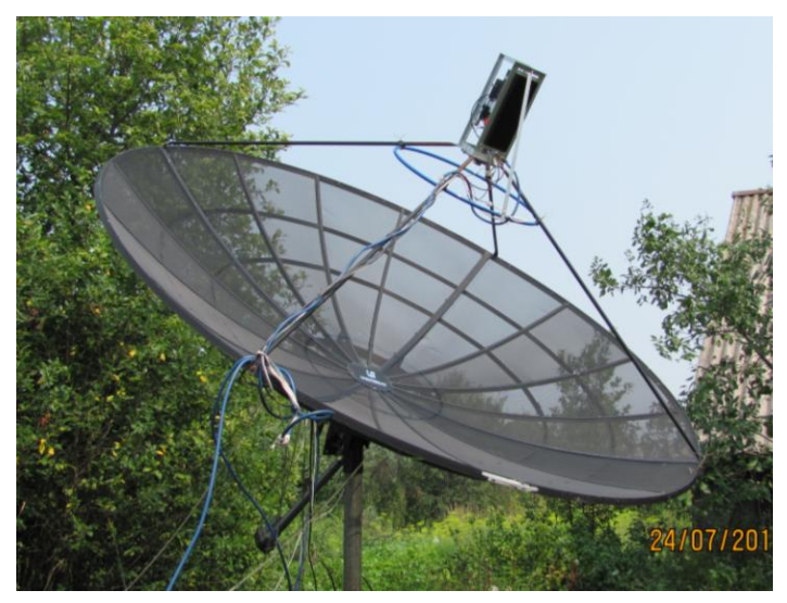
UA3TCF 3 m dish used on 3 and 6 cm

<u>UA3TCF:</u> Alex <u>ua3tcf@mail.ru</u> is now on 5.6 GHz EME -- My first attempt to listen on the Moon was on 10 GHz in the winter of 2012 with my tropo setup and a 3 m dish. The first stations heard were F1PYR, F2TU, UR7D and LX1DB. My sunnoise on 10 GHz was 9.6 dB and moonnoise about 0.4 dB. My second attempt was on 5.6 GHz this July. I now am using on 6 cm a 3 m mesh dish with f/d of 0.38, WD5AGO feed, DB6NT MKU 57G3 transverter with GPS lock and a 12 W SSPA. I measured 13 dB of sunnoise, 4.5 dB CS/G and 0.6 dB moonnoise, Mv AZ control uses a SuperJack V-Box II 24" actuator; elevation control is by wrench, Hi. I optically find the Moon with a monocular. I QSO'd on 6 cm on 25 July OZ1LPR (14DB/16DB) on JT4F, 26 July UA3PTW (13DB/15DB) on JT4F and (O/O) on CW and SM6FHZ (O/O) on CW, and on 29 July OK1KIR (13DB/16DB) on JT4F and (O/O) CW, HB9Q (14DB/12DB) JT4F and (569/539) CW. On 23 cm, I use a 1.8 m dish extended to 2.2 m by mesh with f/d of 0.32, septum OK1DFC feed, 100 W at feed and 0.6 dB NF LNA. I am now building a feed box for my 3 m dish to use on 3 cm band with linear Vert pol feed, 20 W SSPA and 0.7 dB NF LNA. My next band will be 13 cm with my 2.2 m dish. [TNX to RA4SD for forwarding this report].