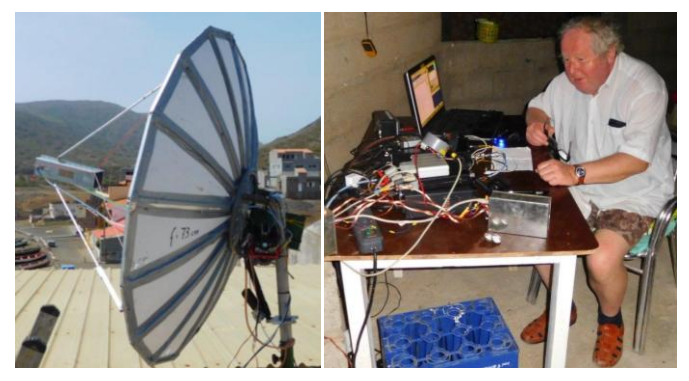
D44TVD 1.5 m dish with 13 cm feed / DL2NDD at op position

2240 HB9Q (15DB), 2256 PA3DZL (18DB), 2304 PA0BAT (21DB), 2314 OF2DG (20DB) and 2324 OK1KIR (18DB), and on 7 Nov at 0030 OZ1LPR (21DB) for a total of 6 QSO. Equipment used was on 432 2 x EF7017 yagis with 380 W at feed, om microwave bands a 1.5 m dish with 100 W at feed on 13 and 9 cm and 55 W at feed on 6 cm. For more information see www.dl1rpl.de.