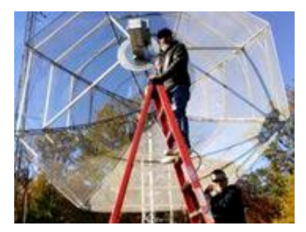
W3HZU's 4.5 m dish with 23 cm feed

<u>W3HZU:</u> Tim (W3TWB) <u>barefoot.tim@gmail.com</u> writes that the W3HZU Keystone VHF Club (FM10pa) has put up a 4.5 m dish and expects to be QRV on 1296 EME very soon. They have a 100 W SSPA, and plan to bring a 600 watt amp on line after initial testing. The club Facebook page is <u>https://www.facebook.com/groups/311697959703/</u>.