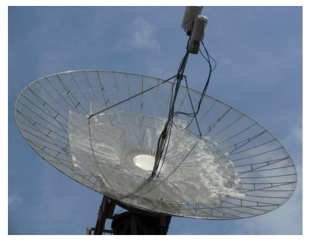
JA6XED's 5 m dish with extra screening for 3 cm

JA6XED: Hisao <u>htk3138ja6xed@kumin.ne.jp</u> is now QRV on 3 cm - I am using my 5 m 6 mm mesh dish on 3 cm. Over only the center part (~3 m), laid 2.5 mm mesh. I made my debut on the 3 cm band on 6 Nov. I had a schedule with K2UYH arranged by JA4BLC. I could hear his signal, but I regret that he could not hear me. On 3 cm, I have 70 W, and see 11 dB of Sun noise and 0.9 dB of Moon noise.