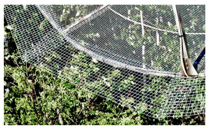
KA1GT's simple hardware cloth dish extension ~+1 dB

KA1GT: Bob ka1gt@hotmail.com sends a 1296 EME update from Maine -- I've added a 6-8" extension to my 2.4 m dish, which makes it a dodecagon with area equal to about a 2.7 m circular dish. I used a couple of 5' x 24" rolls of 1/2 " hardware cloth from Home Depot (<$15) cut into 8" strips. It took a couple of hours to do. With a square to circular flare on my septum feed, sun noise (8.75 dB) is up by about 1 dB; so it was well worth it. I've also increased my power to about 150 W at the feed if the PA is in the shack and 250 W if it's not raining an the PA out at the base of the dish. I've worked a few more stations with good reports, but activity has been low when I've been on. New initials include LA3EQ, XE1XA, IK1FJI, AA7HC, N6BF and W1PV. XE1XA was strong enough to work on CW and he copied me (M) but no two way. I can work CW, but I am currently only using WSJT10 in the CW mode. This means that I'm time sequenced just like JT65 and I'm sending a keyed 800 Hz tone. By default, I use a 1 min sequence but this can be changed to 2 or 2.5 min. This can all be a little confusing for stations not used to working stations using the WSJT CW mode, so be aware of this if you hear me or want to try on CW. I expect to be QRV in June whenever I have a clear shot at the Moon, including during the AA1KK dxpedition to RI and the ARRL's June VHF (tropo) Contest. When I'm on, I monitor the HB9Q logger.