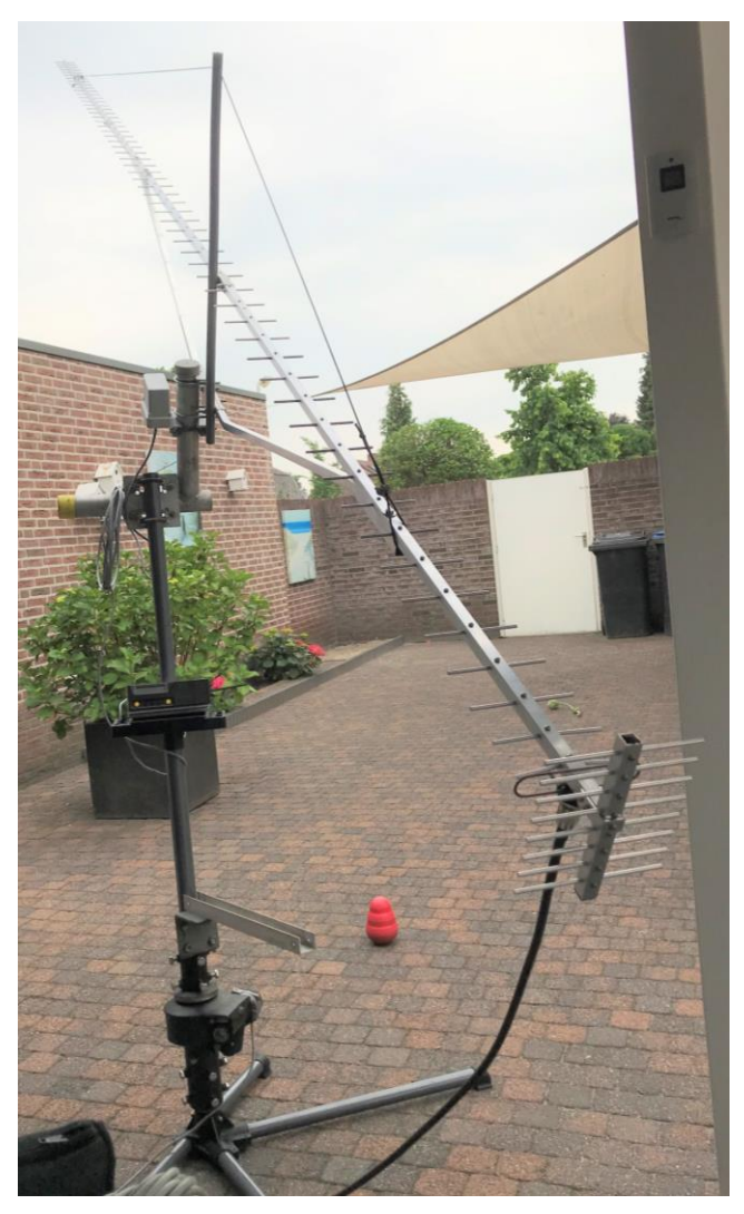
PA3DZL's temporary EME station being used while moving QTHs – on 1296 67 el yagi and 120 W

4X4AJ. Andrey had only 30 W to a small dish. BV3CE gave me another new country. [Translated by OK1TEH].