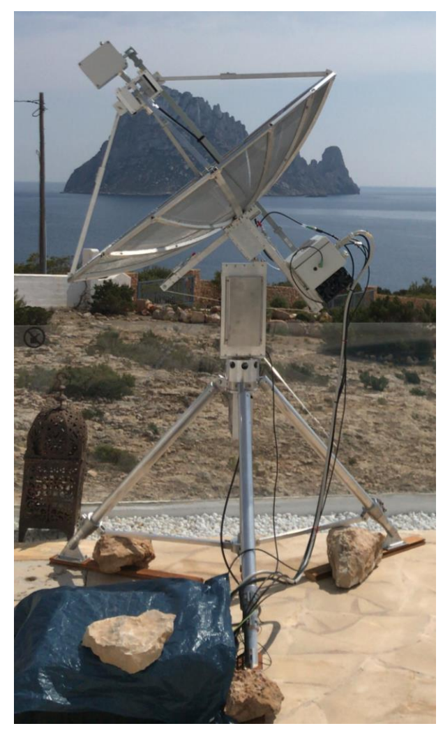
EA6/HB9COG 1.5 dish with 3 cm feed