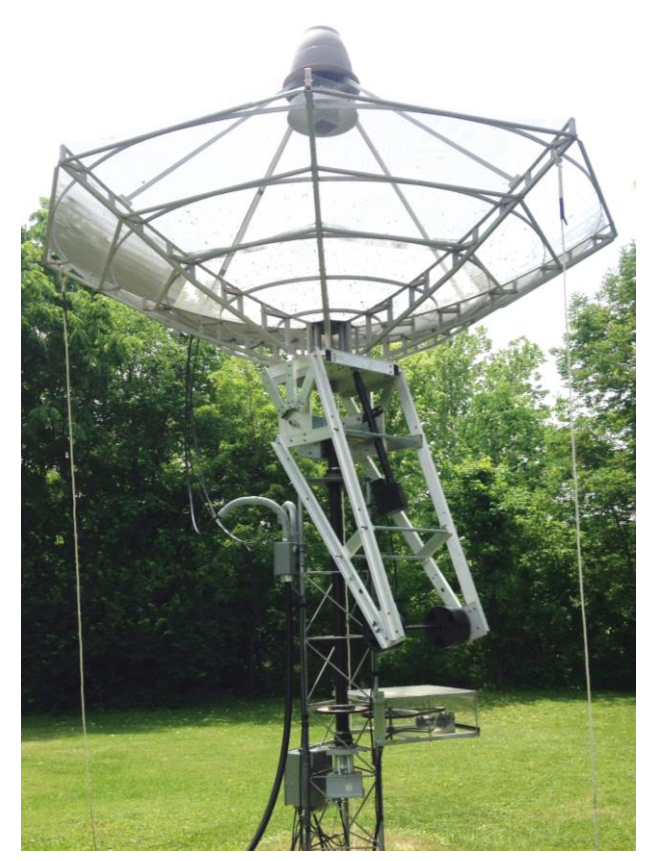
WB8HRW's 3.8 m dish used on 1296 EME

WB8HRW: Roger roger2954@frontier.com is a relatively new station on 1296 EME – I am using a 3.8 m Paraclipse dish with KL6M design HB septum feed/cake pan scalar ring, W6PQL 150 W MRF286 (kit-built) SSPA and G4DDK (kit-built) LNA. I also use HB 23 cm and 144 MHz transverters to an Icom 751 IF rig. A HB sequencer and AZ/EL controller (old-school with 3 turn potentiometers and DVMs). I want to thank K2UYH, W1JR, W1GHZ, W5LUA, W7ZOI, and many others for teaching me about EME and RF. I am only at initial #12; all on CW so far, but I plan to also try JT65 in the future. I am always working to optimize my station so as to be able to contact stations similar to mine. I am interested in skeds and can be reached by email.