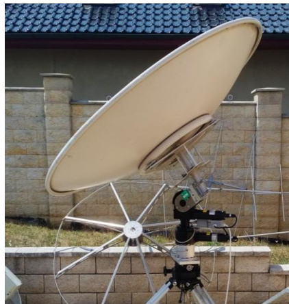
Second 4U1ITU dish under test for 6, 3 and 1.5 cm

4U1ITU: Zdenek (OK1DFC) ok1dfc@seznam.cz has arranged for EME operation on 7 bands from the ITU (JN36bf): 432 thru 24 GHz on 22 Sept thru 1 Oct – I have been spending my moontime preparing for the 4U1ITU dxpedition. I found my previous tripod and system for EL/AZ works well on 10 GHz, but is not good enough for 24 GHz. I decided to build a second tripod with zero backlash and a second tracking system (TNX OE5JFL). This will make available two independent systems. With only one week available in Geneva, the second system will allow us to switch almost instantaneously (about 10 minutes) between the upper and lower bands. This will give us more time on the Moon, and more opportunities to work the lower bands. We will use my 3.2 m dish on 70 thru 9 cm, and a 1.8 m solid dish on 6 thru 1.5 cm. We will always have two bands ready, but not in simultaneous operation. We will arrive on 22 Sept, use 23/24 Sept for setup and test, and plan to be QRV on 25 Sept on 70 cm (1738 to 0333), on 26 Sept on 23 cm (1803 to 0401), on 27 Sept on 13 cm (1828 to 0432), on 28 Sept on 9 cm (1855 to 0502), on 29 Sept on 6 cm (1925 to 0530), on 30 Sept on 3 cm (2000 to 0605), and on 1 Oct on 1.5 cm (2040 to 0530). If activity slows up on a given band, we will switch to the alternate band, just as we did EA9.