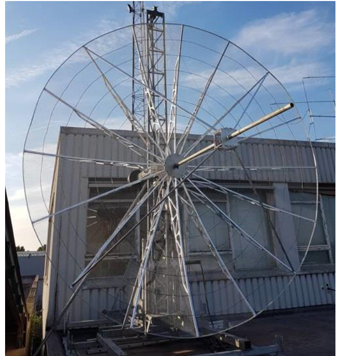
ON4ANI is now on both 23 and 13 cm EME and listened during the recent MWA on 2320