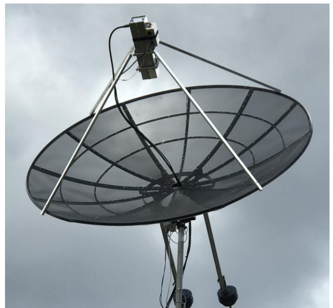
SM4GGC's 3 m dish used with 250 W SSPA on 3 cm

SM4GGC: Stig stig.ake.larsson@gmail.com has been QRV on 1296 EME since the end of June – I am using a 3 m dish with a Septum feed, 250 W PA with 7 m of LCF 12-50 to the feed, a G4DDK preamp and a TS-2000 transceiver. So far I have worked on 18 June using JT65C VK2JDS , PA0BAT, LA3EQ, F1RJ, I1NDP, OK1IL and I5YDI, and using CW I1NDP (559/559) and EA8DBM (519/559), on 19 June using JT65C PA3FXB, G4CCH, PA2DW, K5DN and K5DOG, and using CW G4CCH (559/559), on 5 July using JT65C DL8FDB and LA3EQ, on 6 July using JT65C DK5YA and using CW UA3TPW (569/569), on 9 July using JT65C WA3RGQ and VA6EME, on 10 July using JT65C DK3WG, DF2VJ and HB9Q, on 11 July using JT65C LA3EQ, and on 16 July using JT65C VK4CDI, DJ9YW, W1PV, IK3COJ and OK1IL.