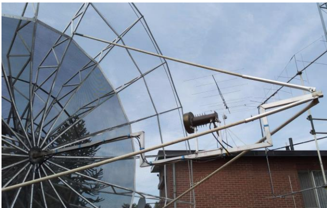
ON4GS's HB 6 m dish with 13 cm feed in place

ON5GS: Dirk dirk.reyners@telenet.be tried some SWL tests during the 13 cm MVAW -- On 4 and 5 Aug I did some tests on 13 cm EME with a feed from PA3CSG. There was quite a bit of activity on the HB9Q chat and most people were pleased to provide signals for reception tests. My PA is not yet ready. I used my 6 m HB dish with a KEPS-preamp (from my old oscar-40 mode S station) and a LZ5HP transverter. On Saturday I receive ZS6EME (17DB) for my copy on 13 cm! The next day with G4DDK preamp ZS6EME (13DB), ON4AOI (12DB) and astonishing I had SSB and CW reception from ZS6EME, G3LTF, OH2DG (very strong!) and K2UYH. I should have TX very soon. I hope to see many of you at EME2018.