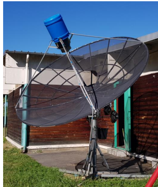
F6ETI's 3 m dish