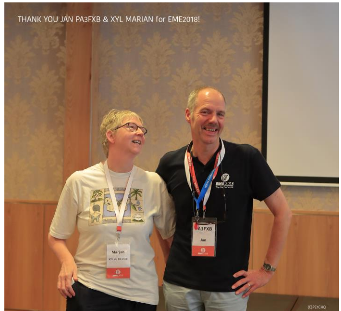
TNX PA3FXB and Marjan for terrific EME2918!

▶ TNX for all the reports. We are trying to get this NL out with some lead time before the first leg (13 cm up) of the ARRL EME Contest. We are looking forward to seeing you off the Moon and if possible QRV on 2300 up in the contest. 73, AI - K2UYH and Matej – OK1TEH