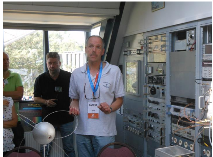
PA3FXB demonstrating pulsar reception at Dwingelo