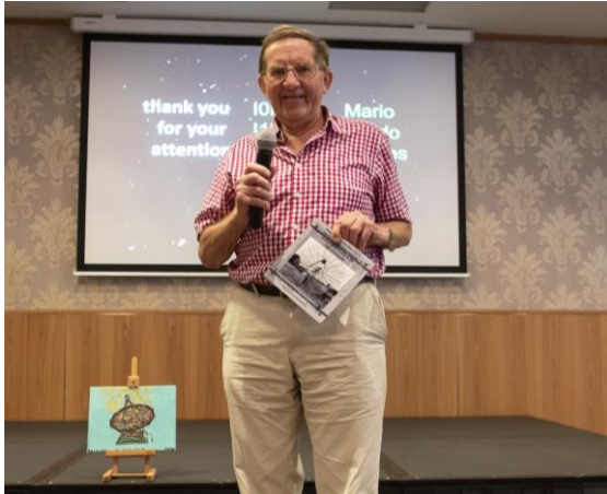
G3LTF received the Lifelong EME Achievement Award at EME2018

from 5 degs to 1 deg; so that was the end of my activity! I ended with a total of 27 QSOs. My Sun noise on Sept 8 was 20.9 dB with an SF 67!