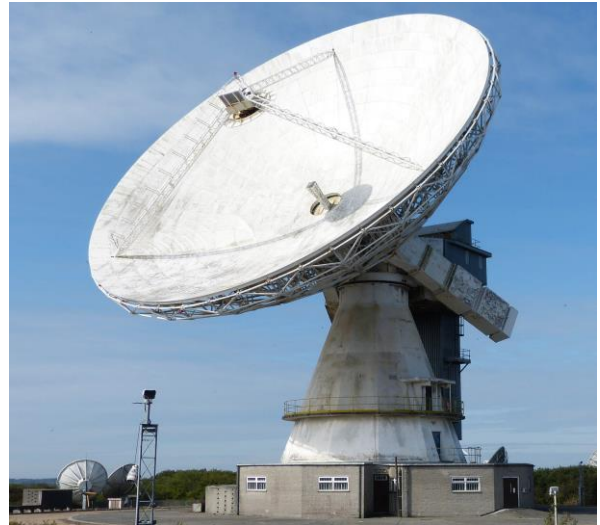
Goonhilly Earth Station 32 m dish

return loss was only 8 dB as we were below the design frequency of the feed. We did add an isolator to protect the PA. On 6 cm we were running 40 W. We received plenty of (599) reports so the system was working. Thanks to all those who came on to call us. QSL requests should be emailed to me and I will QSL direct. We were also able to give some operators new to microwave EME a chance to operate with this system and to give demonstrations to visitors to Goonhilly Earth Station. When conversion of GHY6 for the deep space network starts it will no longer be available for amateur radio, but we are hoping that GHY3, a 29.6 m antenna with a conventional Cassegrain feed may be available. So, we are thinking of suitable feeds and looking for ideas.