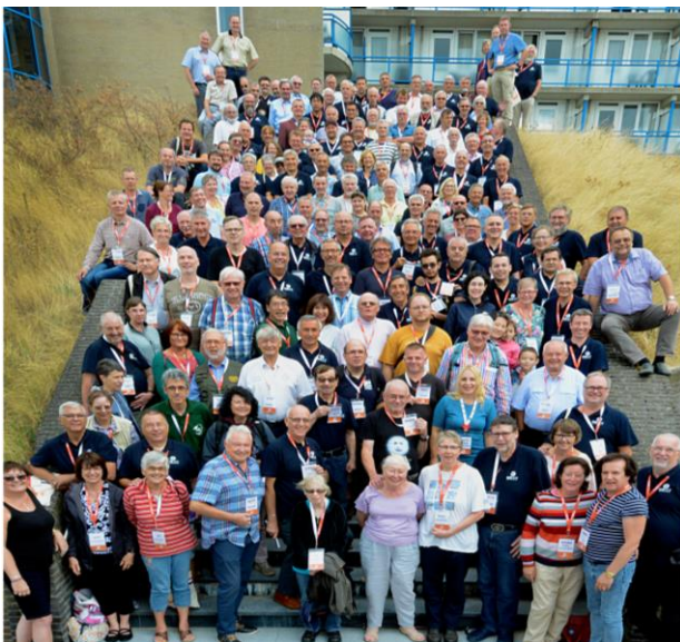
EME2018 the Netherlands family photo