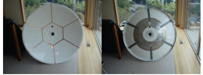
VK7MO's cutup dish to allow air transport for world distance record and ZL grid expedition

there will be plenty of opportunities to work ZL on 3 cm when we return for the grid expedition.