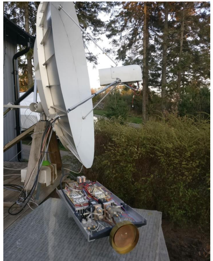
SM6PGP's 2.3 m dish with patch feed & 350 W SSPA