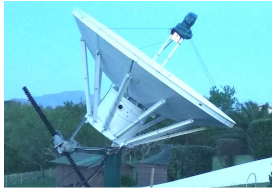
F2CT 4 m dish on 1296

contest, I worked 50 stations using CW. Especially strong signals were from HB9Q, UA3PTW, OE5JFL, OZ4MM, DL3EBJ, SP6JLW, SM6CKU, KL6M and W4OP (the loudest). I still want to improve my reception by adding DSP filters; as it was very difficult to decode multiple CW signals all calling at the same time and QRG. My apologies to those that called with no reply.