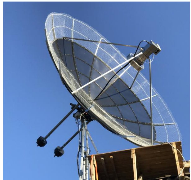
SM4GGC expanded dish (from 3 to 3.8 m)

you can see how it was done. I have also increased my power to 500 W with a W6PQL PA. The Dubus 23 cm EME Contest was very nice and all seems to work well. I QSO'd on CW OK2DL, UA3PTW, RA3EME, OH2DG, SP7DCS, OK1CS, SM6CKU, G3LTF, RA3EC, KL6M, G4CCH, ES5PC, SP6JLW, OK1CA, OE5JFL, SP2HMR, SP3XBO, OK2ULQ, SK0UX, SP6ITF, OZ6OL, IK3COJ, OH1LRY, I1NDP, DL7UDA, ES6FX, F5KUG, PI9CAM, SV3AAF, W4OP, LZ2US, DL6SH, HB9Q, PA3FXB, SP2HMR, EA8DBM, DL3EBJ, IW2FZR, F2CT, 9A5AA, DK3WG, OZ4MM, OK1DFC, DL7YC, K7CA, K2UYH and WA6PY for a score of 47x42. I also added on 14 April the VP2EMB dxpedition using JT65C.