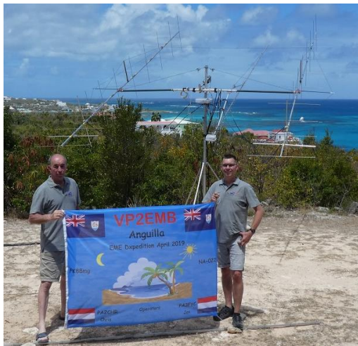
VP2EMB team (PA2CHR and PA3FYC)

The next Dubus CW Contest is 11/12 May on 10 GHz http://www.marsport.org.uk/dubus/EMERestContest2019w_eb.pdf . Also, the same weekend is the ARI Spring EME Trophy Contest covering all EME bands and all modes. See www.eme2008.org/ari-eme/contest.html . There is no 70 cm CW Activity Time Period (ATP) in May because of the ARI EME Contest.