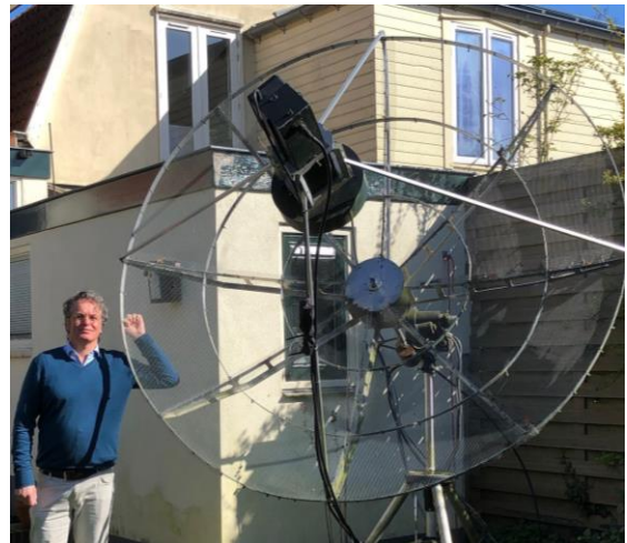
PA2DW and 2.4 m dish on 23 cm