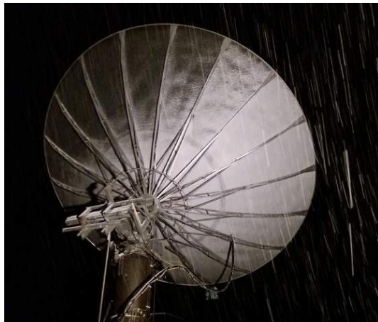
SP6JLW's 6.5 m dish during 23 cm Dubus Contest covered with snow

SP6JLW: Andrzej (SP6JLW) and Pawel (SP6OPN) sp6jlw@wp.pl report on the Klodza group's active during the Dubus 1296 Contest -- We operated under the callsign SP6JLW and completed 68 QSOs x 60 multipliers. This result was worse than in previous year because of bad WX. We suffered from a thick layer of wet, sticky snow on the dish's surface that affected our RX. Snow removal attempts helped temporarily, but the snow kept falling intensely throughout the first moonpass of the contest. QSO'd were SM6CKU, SM4GGC, SM2CEW, SK0UX, SM6PGP, RA3EC, RA4EME, RA2FGG for an initial (#), UA3PTW, RN6MA, OK2DL, OK1CA, OK2ULQ, OK1YK, OK1IL (#), OK1CS, OK2PE, SP2HMR, SP3XBO, SP6ITF, SP7DCS, DL7UDA, DF2GB, DL6SH, DL7YC, DL3EBJ, DK3WG, IK3COJ, IW2FZR, IK5VLS, I1NDP, I0NAA (#), IK5GHY, FR5DN (#) and new DXCC , LZ2US, OZ4MM, OZ6OL, G4CCH, G3LTF, OE5JFL, KL6M, W4OP, K7CA (#), K2UYH, WA6PY, K5DOG, W4AF, OH1LRY, OH2DG, VK5MC, VK4AFL, F6KRK, F2CT (#), F5KUG, F5JWF, VE6TA, LA1K (#), SV3AAF, PI9CAM, PA0PLY, ES5PC, ES6FX, 9A5AA, S59DCD, HB9Q, EA8DBM, JA4BLC and JR4AEP. [TNX to OK1TEH for translating from http://emejo80jk.cba.pl ]