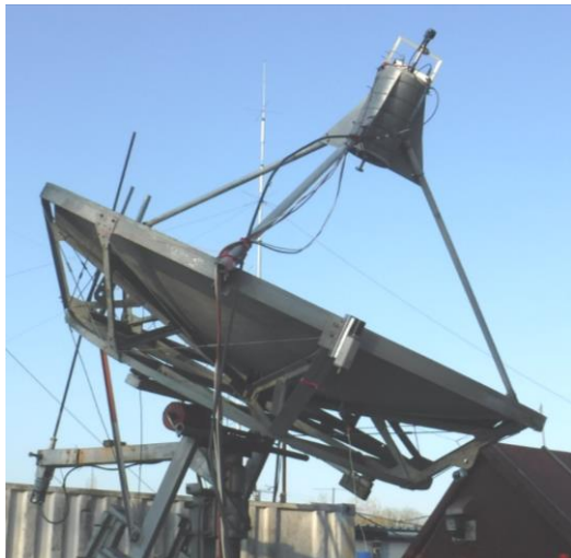
G4RFR 3.4 m with 10 GHz system

developed software to interface to NEC Selsyns. It just turns on goes and even works via mobile phone). The frontend is a modified Octagon LNB. The feed is a VE4MA via 90 deg twist onto a 4-port switch. Its position can be remotely adjusted using a small linear jack with a digital readout. On TX we currently have only 10 W, but it is mounted in the feed box with its associated power supply. The backend systems are all HB with GPS locking to the up and down mixer/LO. All narrow band modes are available via CAT controlled IC746 for WSJT and CW/SSB. We tested on 11 April and worked OZ1FF (no final Rs), UR5LX, OK1KIR, PA0BAT (CW), OH2DG (CW), DL6ABC and a partial with SM2CEW (CW). All contacts were on WSJT [mode?] unless indicated as CW. Several were on random and the others arranged on HB9Q. During this one session we worked almost as many stations as we worked during our total activity back in 1994. We have QRO PA nearly ready. The required 50' of interface cables have now been tested and the system only needs to be integrated for final testing. We hope to deploy on the dish during this summer. The FRARS consists of G0API, G3YGF and M5AHV.