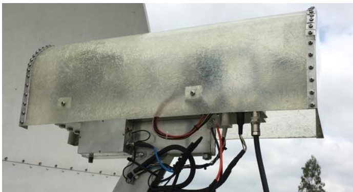
PY2BS 10 GHz feed arrangement