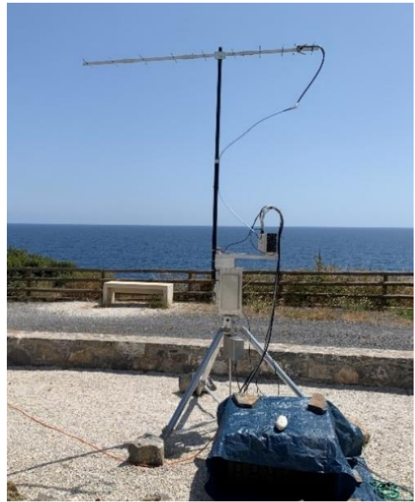
SV9/HB9CRQ 11 el yagi used on 432 EME

SV9/HB9CRQ: Dan (HB9CRQ) dan@hb9q.ch and Sam produced a text book 6 band (70 cm thru 3 cm) EME dpxpedition to Crete. We do not yet have the full story; a summary follows, but Dan has promised to send pictures and more details for the next NL. On 70 cm they used JT6B to make 8 QSOs and 8 initials in 7 DXCCs; on 23 cm they used JT65C and CW to make 104 QSOs and 85 initials, 7 were on CW in 24 DXCCs; on 13 cm they used JT65C and CW to make 19 QSOs and 14 initials, 5 were on CW in 10 DXCCs; on 9 cm they used JT65C and CW to make 15 QSOs and 10 initials, 5 were on CW, in 8 DXCCs; on 6 cm they used QRA64D to make 20 QSOs and 15 initials, 7 were on CW in 12 DXCCs; and on 3 cm they used QRA64D and CW to make 28 QSOs and 22 initials, 9 were on CW in 13 DXCCs; for a total on 194 QSOs and 154 initials, 33 were on CW in 30 DXCCs. Please send your QSLs with an SAE to HB9Q, P.O. Box 133, CH-5737 Menziken. They will be on again from A21EME in Oct.