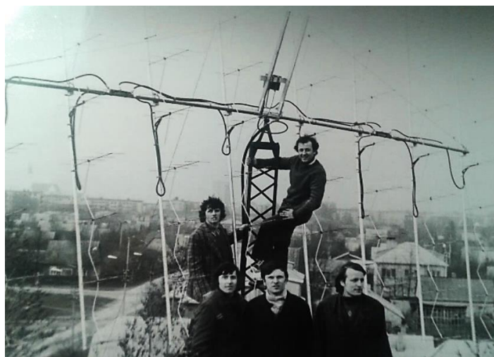
UK2BAS team 1979