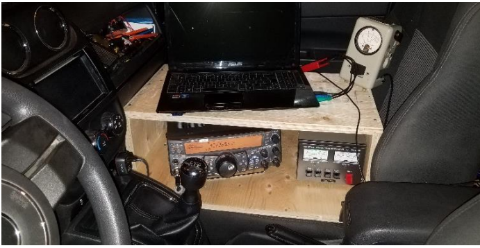
VA2ELE dxpedition operating position