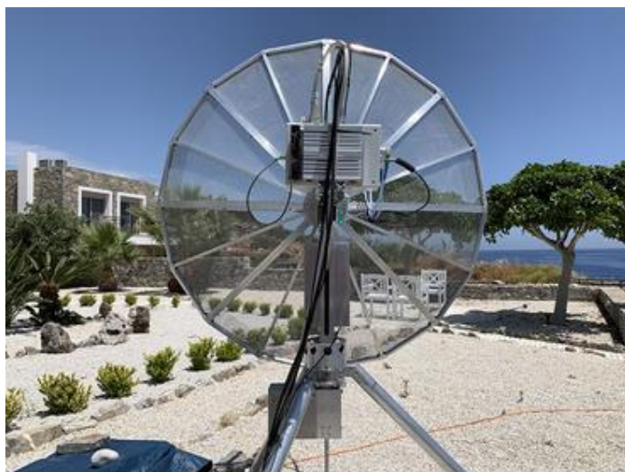
SV9/HB9CRQ's 1.5 m dish at Crete dxpedition site

Microwave Activity Weekend (MVAW) for 2019 -- At the Swedish EME Meeting, it was decided because the 6 cm and 9 cm EU/Dubus CW EME Contests are coming up shortly and because it is highly likely that more of the Scandinavian countries (SM/OZ) may lose access to 13 and 9 cm this summer, it was agreed that the remaining "good" weekends should be used to maximize the