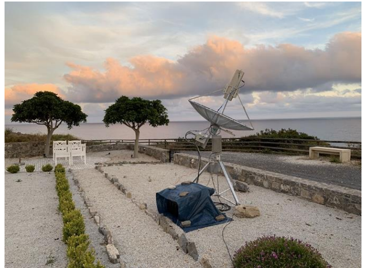
SV9/HB9CRQ on 1296 EME

▶ If you are QRV on 6 cm and/or 9 cm don't miss the Dubus weekends. We both plan to be QRV on EME. 73, AI - K2UYH and Matej – OK1TEH