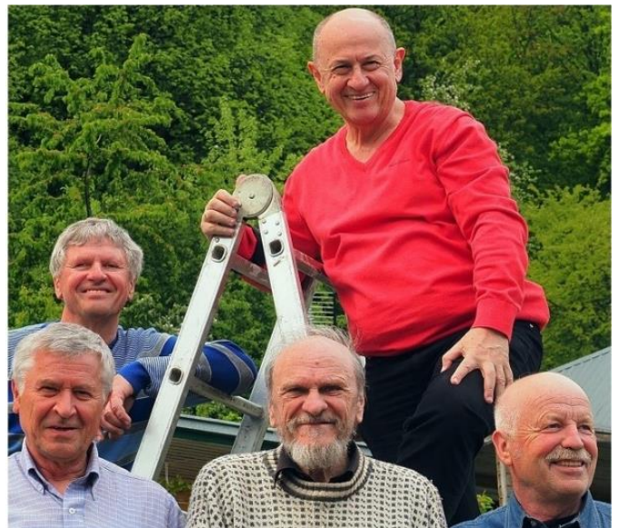
UK2BAS team 1979

The operators recently met after 40 years to reminisce and discuss new challenges.