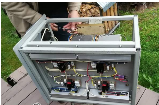
Making a quick fix of SP6JLW's 23 cm PA

SP6JLW: Andrzej sp6jlw@wp.pl and Jacek (SP6OPN) took part in the Oct leg ARRL EME Contest on 23 cm -- We used the callsign of SP6JLW, and initially intended to operate in the "Multi operator CW Only" category. Our plan was to work on two bands, 70 and 23 cm, with priority on 23, while remotely monitoring 70 (to avoid interference) and switch when we found activity there. Unfortunately, CW activity was even lower than last year and there was no point in wasting time, especially since 23 was very active. We put off the 70 cm band for the second round. During the first orbit, we had a minor PA failure, it was removed and quickly fixed. On 23 cm using only CW we made 68 QSOs with F6ETI, DL6SH, DL3EBJ, JH1KRC, I5MPK, F5KUG, OK2DL, SP7DCS, FR5DN, RA4HL, DF3RU, IK1FJI, DG5CST, OK1CS, PA0PLY, DL4DTU, JH4LJB, G4CCH, OK1KKD, UA9FAD, PE1LWT, IK3COJ, IK5VLS, SM6PGP, PA3FXB, IK3MAC, SM4IVE, DL7UDA, OH1LRY, DL0SHF, UA3PTW, OE5JFL, W4OP, SP3XBO, SP6ITF, OK2ULQ, AA4MD, VE4SA, YL2GD, RA3EME, G3LTF, W6YX, OZ4MM, S53MM, K0PRT, LZ1DX, N4PZ, VE6TA, VA7MM, IW2FZR, N5BF, WA6PY, WK9P, VK3NX, RA3AUB, OK1CA, SP2HMR, I1NDP, LA3EQ, OH2DG, F6KRK, DJ3JJ, G4RGK, SM4DHN, K2UYH, WK9P (DUP), IK2MMB and WA9FWD. If we missed you, we hope to CU in the second round! [TNX to OK1TEH for translating http://emejo80jk.cba.pl/aktualnosci.html ].