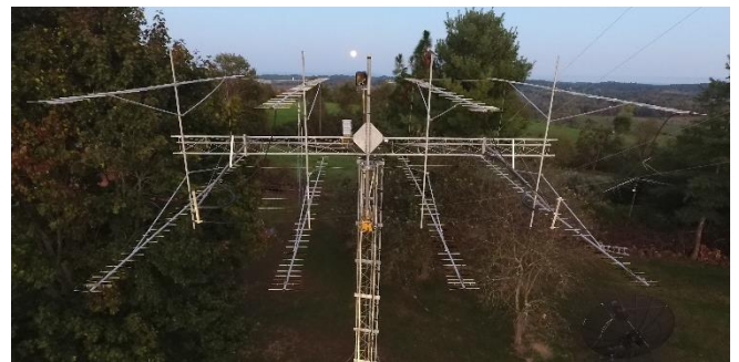
K4EME's 16 long yagi array for 432

K4EME: Cowles candrus@mgwnet.com wrote the following related to his participation in the Oct ARRL EME Contest -- Conditions here were terrible with high winds, heavy rain and cloud cover. With the cloud cover during the contest, I was off the Moon most of the time. This explains why I only worked some of the larger stations. I never hear very well during heavy rains. Also, I had a much higher VSWR than normal. Now for some good news, I was able to fix my tracking issue with a Green Heron engineering controller. I can now track the Moon's azimuth and elevation well - within about 0.2 degs when I have no wind! This should improve both my TX signal and RX sensitivity during overcast conditions, when the Moon's view is not available. In the contest, I operated on both 70 and 23 cm and worked around 30 stations . This was way down from last year when I had clear skies and much better weather for most of the contest.