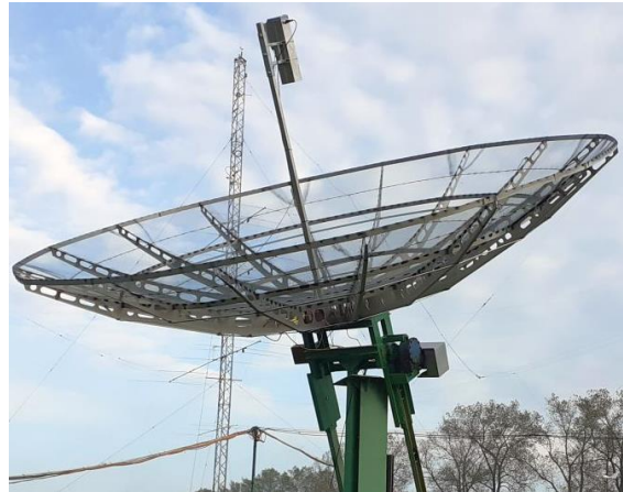
OK1UGA's 6 m dish used for the first time on 1296

such as how to best adjust for Doppler; but I am very satisfied with the results of my first try. They far exceeded my expectations. I have a lot to do. My main task is to build a high power PA. I already have the components. I plan to reappear again on 23 cm next year. [TNX to OK1TEH for translating - http://ok1uga.nagano.cz/emeqth23.htm ].