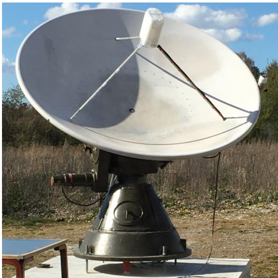
OZ6OL's 2.4 m dish used on 3 cm

OZ6OL: Hans oz6ol@mail.dk is now QRV on 3 cm -- I got my 10 GHz system on air a few days before the Dubus 10 GHz Up Contest. I almost immediately heard SM6CKU and called him for my first 3 cm QSO. Ben's had a very nice CW signal. Later I worked ES5PC and OH2DG also on CW. In the Dubus Contest I QSO'd on CW OK1KIR, SM2CEW, SP6JLW, SA6BUN, OZ1LPR, HB9BHU, OK1CA, G4NNS, OH2DG, F2CT, OK1DFC, RA3EME, DB6NT, SP3XBO and PA3DZL for a total of 15x13. In the ARI Contest the following weekend, I worked on 3 cm SM6PGP, IW2FZR, HB9BBD, UR5LX and PA0BAT. All 5 QSOs were on random CW. My station consists of a 2.4 m center feed dish and 22 W with WG system. My CS/G is 6 dB, Sun about 15 dB and Moon noise up to 2 dB. I am at a new QTH, but the grid is still the same (JO65dj). My 23 cm dish is down, so my only EME band at the moment is 3 cm.