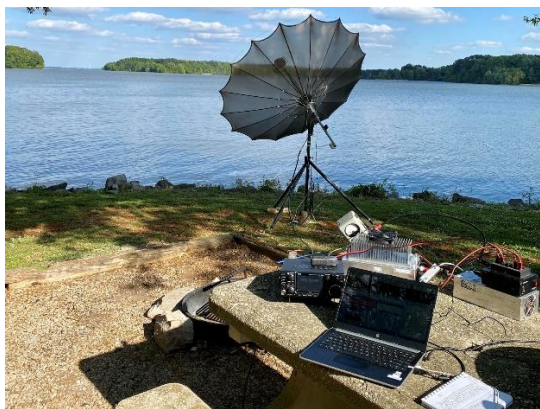
Al fresco operating on the shores of Wheeler Lake, AL