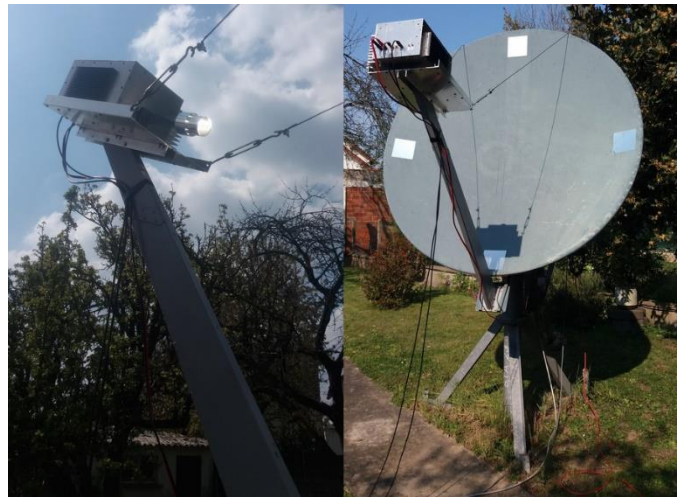
F5HRY's 1.8 m offset dish used for 10 GHz CW EME