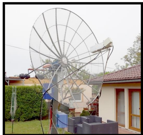
OM4XA's home made dish for 23 cm EME

OM4XA: Fero cesnefk@gmail.com reports on the 23 cm DUBUS Contest -- I was active during both days. Only on Sunday we had raining from early in the morning. I had literally a "waterfall" and water caused some of problems that delayed my arrival at the shack until around lunch time. With my setup, a home-made 3 m mesh dish, IC9700 and 200 W SSPA, I worked 17 QSOs on Saturday and added 8 on Sunday for a total of 25 QSOs and 22 mults. I added 10 CW initials with DL0SHF, OZ4MM, OK1KKD, OH100SRAL, SM6CKU, DL6SH, OK1CS, SP7DCS, K2UYH and W6YX to bring me to #33. There were a lot of stations on the band, but with my equipment I didn't call many and probably didn't hear all. But overall, I had a good time and improved my score with all the analog traffic. [TNX to OK1TEH for translating this report].