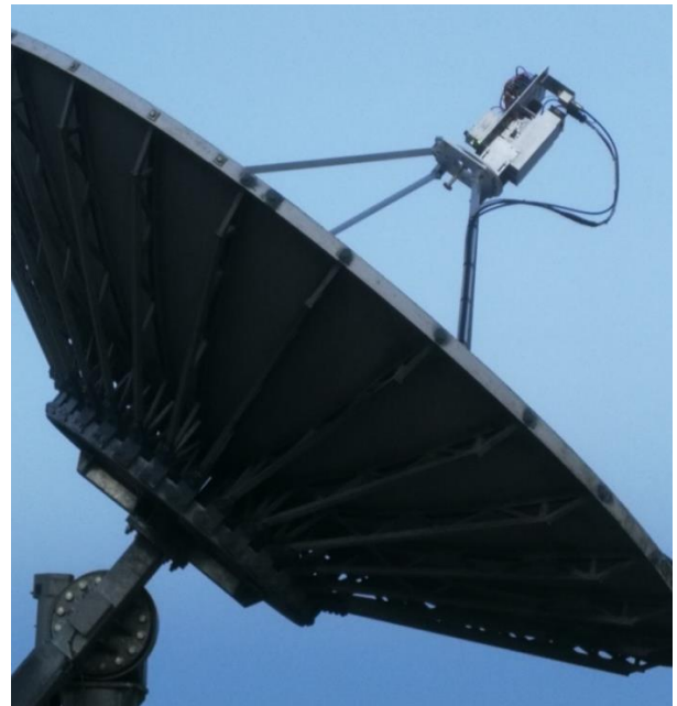
SA6BUN's rig used to provide 1 st SM 24 GHz QSO

PA3DZL: Jac pa3dzl@icloud.com sends news on his April/May activity -- I was very pleased with the activity and my results during the 10 GHz Up Dubus EME Contest. Worked using CW on 17 April were RA3EME for mixed initial #79*, OK1KIR, OZ1LPR, SP6JLW, OK1CA, ES5PC, YO2BCT, OK2AQ, DB6NT, SA6BUN, DL4DTU, HB9Q, HB9BBD #80*, F2CT #81*, SP2HMR, F5IGK, OK1DFC, OH2DG and W3SZ, and on 18 April VK3NX, IW2FZR, F5HRY #86*, OH1LRY #87*, HB9BHU, UR5LX, SM6PGP #88*, SP3XBO, OK2AQ [DUP] and OZ6OL #89* for a total of 28x23. Outside of the contest using Q65, I QSO'd CT1BYM, F6BKB #82*, SM6CKU, F5IGK, G4BAO #83*, OK1DFC, CX2SC #84* and DXCC 33 , OE4WOG #85*, VE6TA #90* and DC7KY #91*. The day after the contest I added SM7FWZ using CW #92*, G4BAO Q65, WA9FWD CW #93* and SM2CEW CW #94*. During 23 cm EME Dubus/VK3UM CW Contest , I also had a great time. All the CW signals were amazing. I ended with 52 QSOs with 51 on CW and 1 on SSB. The band was full of "beacons". I admire all these OMs that were active throughout the full or almost full Moon window. The strongest signals were from DL0SHF on CW and LX1DB on SSB. I must mention that I worked KB7Q on 23 cm from NM, AR, MS, AL and KY for 5 new States. I want to echo the comments of on sending CW and callsigns. Please send your callsign many times, call for longer periods and do not stop - DO NOT GIVE UP!