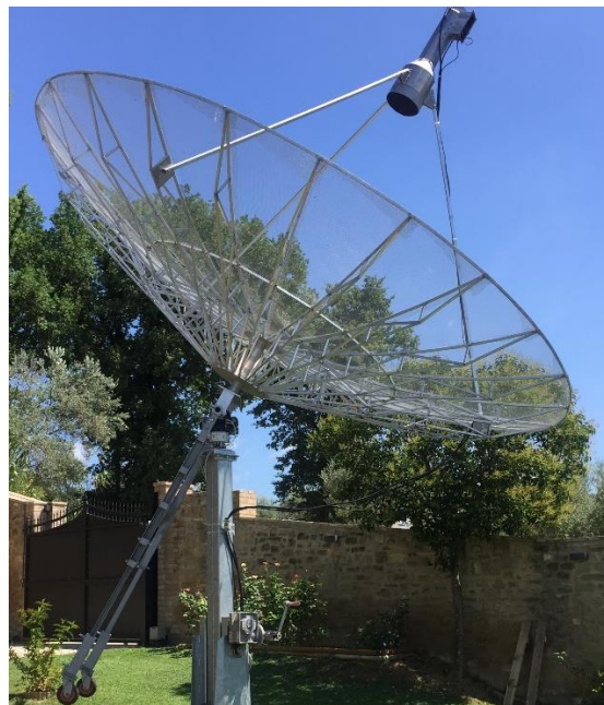
IONAA 5 m dish with 23 cm feed

The concept of using a lunar crater on the backside of the Moon for a radio telescope site is nearing reality. It has NASA funding, although not yet an official project. Interest is in very low frequency radio astronomy. The impact on our knowledge of the universe could be immense! Info on the Lunar Crater Radio Telescope (LCRT); Illuminating the Cosmic Dark Ages, can be found at https://www.jpl.nasa.gov/news/lunar and at https://www.jpl.nasa.gov/news/lunar-crater-radio-telescope-illuminating-the-cosmic-dark-ages .