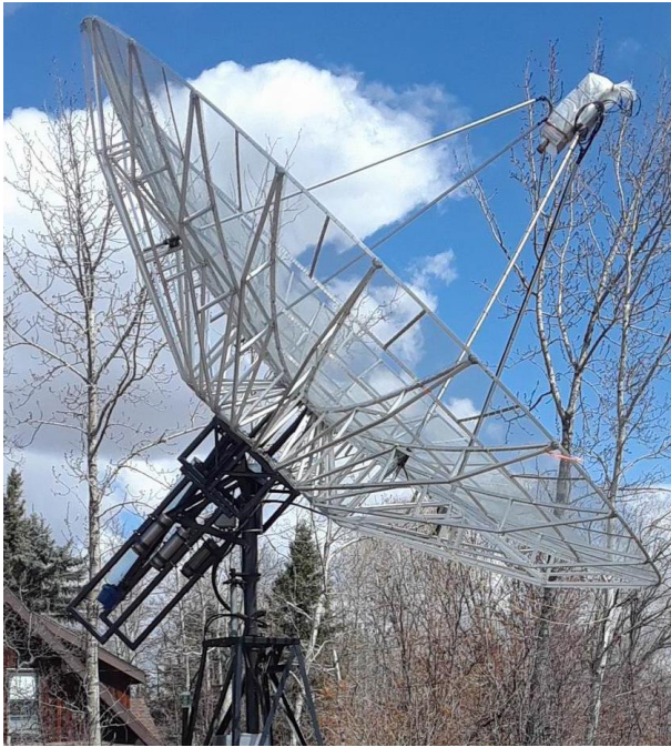
VE6BGT dish with 6 cm feed

supply - old school stuff, Hi. Great echoes and good signals from all over! I worked: VK3NX (569/569), VE6TA (569/579), KL6M (579/569), OZ1LPR (559/569), G3LTF (579/569), DL7YC (579/579), OK1KIR (569/569), OK1CA (579/579), UA3PTW (569/569), ES5PC (569/569), SA6BUN (569/559), VE4MA (559/569), OH1LRY (579/559), WA9FWD (549/569), JF3HUC (559/569), K2UYH (559/569), WA6PY (569/569), SM6CKU (569/569), OK1DFC (559/559), DF3RU (569/569) and PA3DZL (569/569) for a total of 21x19. I did hear G4CCH but missed him this time. A lot of these contacts were first time QSOs - initials. It was a lot of fun as usual. I plan to be on for the 9 cm MVAW event on 3/4 July.