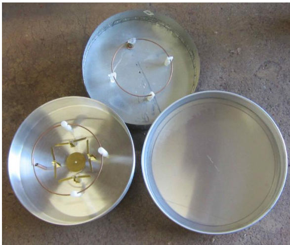
Several of KNOWS' bake pan feeds including a HB version, dual band and an empty pan

TECH: Want to easily make a loop feed for 432. KNOWS suggests rather than fabricating the cylinder that the loop fits into out of sheet metal as he did the first time, just buy a pan of the approximate size. He has found several, but recommends a 16" "Tezzorio" cake pan. It is available on Amazon for ~ $25 at https://www.amazon.com/Tezzorio-Aluminum-Smooth-Sided-Professional-Bakeware/dp/B07H6NQZGL/ref=sr_1_2?dchild=1&keywords=tezzorio+16+inch+cake+pan&qid=1622739697&sr=8-2 .