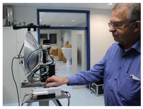
DB6NT with his 241 GHz Station