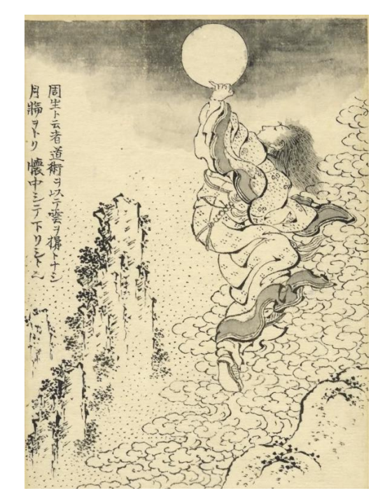
Daoist master Zhou Sheng ascends a cloudladder to the moon

"One day during the Autumn moon festival, Zhou Sheng stayed at a Buddhist temple and overheard a group of pilgrims lamenting that they would never see the legendary Palace of the Moon for themselves. Zhou fashioned al adder of clouds, climbed to the moon and descended with it for the pilgrims to see."