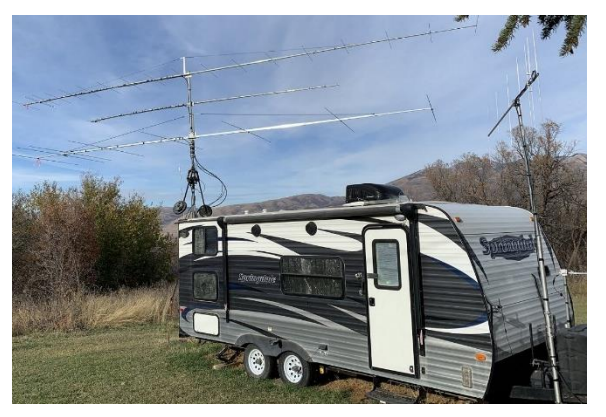
K7ULS antennas in ARRL EME Contest

K7ULS: Mike <u>k7uls@yahoo.com</u> had excellent results on 432 during Nov Contest weekend -- I used my single M2-432-9wl yagi and 250 W from a Gemini70 SSPA to work using Q65B on 12 Nov at 0330 DL7APV (22DB/20DB) and on 13 Nov at 1242 NC1I (21DB), 0507 K5QE (24DB/27DB), 0524 K2UYH (22DB/26DB), 0550 W7JW (32DB/30DB) and 0608 K0PRT (29DB/25DB) for 6x6 total.