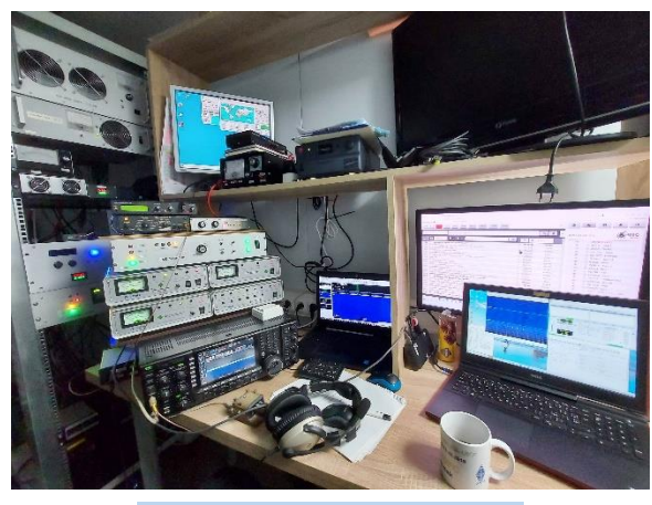
OK1DFC operating position

In the ARRL Contest, 1296 activity broke all records . This will be hopefully not an exception but an indicator of the future. 1296 has clearly become the band for EME CW operation. The top CW QSOs reported were from IK1FJI with 74. It shall be interesting to see what the activity levels will be during the VK3UM Memorial/Dubus Contest on 22/23 April. We do not have the full picture of ARRL Contest results, but of the reports received OK1DFC is the clear leader with a total operating only on 23 cm of 185x63 for 1,159,200 points. On 432 DL7APV again has the top reported score of 104x54, which is down from the past, but Bernd operated 3 bands this year. The K2UYH group has the highest multiband total of 4,631,500 points received thus far.