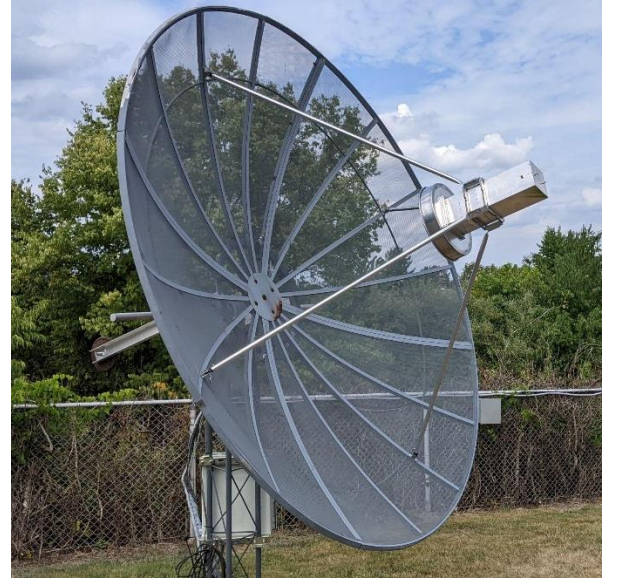
W2ZQ 3 m dish used on 1296 in the ARRL Contest

W2ZQ: Paul (W2HRO) w2hro.fn20@gmail.com reports on the DVRA's ARRL EME Contest effort - This was our best results by far! We operated exclusively on 1296 multimode and ended with a claimed score of 128 x 52 or 665,600 points. The effort was led by K1JT with operators AC2YD, AD2CC, K3EA, KB2MT, W2HRO, W2LPL and WX2S; many of whom were first experiencing EME. The station consisted of a 3 m dish and 250 W (closer to 215 W at the feed). I think we did a great job! QSOs added using Q65C unless noted as CW were on 12 Nov DL4DTU, G0LBK, OK1KIR, DG5CST CW, SP9VFD CW, DF7KB, AC0RA, W5AFY, N0CTR, W5GLD, SP3YDE, PA3HDG, W5LUA, KD5FZX, K6VHF, OK1UGA, DF2VJ, WA3GFZ, ON4QQ, SK0CT, N9LHS, N9HF, OK2UZL, VE4SA, AA4MD, JS6UJS and UA9YLU, and on 13 Nov DL4DTU, UA5Y, SP7EXY, OK1DFC CW, F6COJ CW, NC1I, K8ZR, W1PV, W3HMS, DL8FBD, AE6GD, SV1CAL, GM0PJD, OK2ULQ, SM6PGP, W6TCP, OK1IL, LA3EQ, G3LTF CW and JH7OPT.