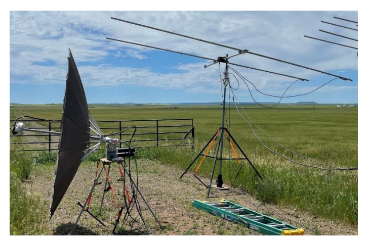
KA6U's 23 and 70 cm antennas in ND at moonrise

I plan to lend this 23 cm EME station to operators in states that I don't visit. The station will be compact and easy to ship. K5QE, NC1I, W6TCP, N1AV, NH6Y and I have collaborated to deploy a permanent 70 cm station at Tom's QTH on Maui. The initial station was operational starting in early Dec. Tom's current station is using the PA and antennas that I used roving last Summer, but with HPOL only. We plan to continue to improve the station in the next months. The station should eventually be better than the station I use for roving. The photo shows the 23 and 70 cm antennas in North Dakota at moonrise. The total setup time for both arrays is 40 minutes. Running pile-ups on both bands at 2:00 am LT in the morning is a good way to wake up. This day in North Dakota started after sunrise. For more info see http://ka6u.blogspot.com.