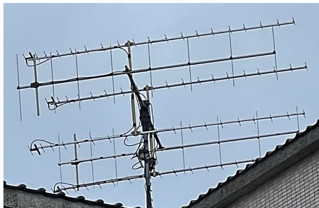
BV3CE's 4 x 20 el yagis on 70 cm

Congratulations go to HB9Q for receipt of 1296 WAS #6, VE4MA #8 and N5BF for WAS (#?), and to W5AFY for 432 WAS #31. Also IK2COJ reports completing 1296 DXCC on 21 Feb with ZL1NJR!