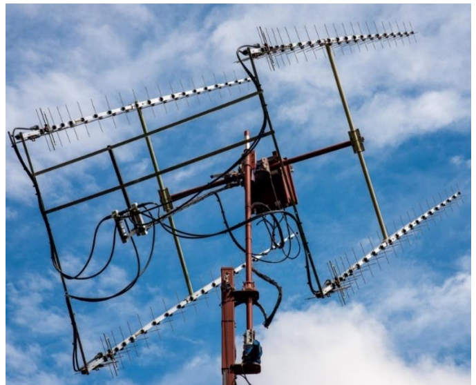
VK2CMP's 4 x 21 el X-pol yagi array used on 432 with 1 kW PA

VK2CMP: Mick vk2cmp@me.com is now up to mixed initial #99* on 432 EME -- I spent my Xmas break moving the 10 m mast of my 4 x 21el X-pol yagi array to new footings further from the house. The old location prevented me from being able to lower the carriage/array down for maintenance and in storms. The array would slip in large winds and not being able to lower it, this meant that I just kept putting larger offsets in my PST rotator counter. I took the opportunity to up grade the array mounting and rotator. It now functions much better in poor weather. I also have adaptive pol. The 1st LNA is a cavity WD5AGO LNA, which has the 2nd stage replaced with a filter and in turn feeds a 2nd Kuhne LNA. On TX I have a Beko HLV-1470 PA which runs at 1kW that the special permit of my license allows. Since the last NL, I have added initials with W2HRO, WA5AFY and new DXCCs with IZ4FUA and NH6Y to bring me to initial #99*. Who will be 100? I have purchased a very very nice bottle of rum as an incentive and look forward to opening it when I work #100*. The bottle is sitting above the radio.