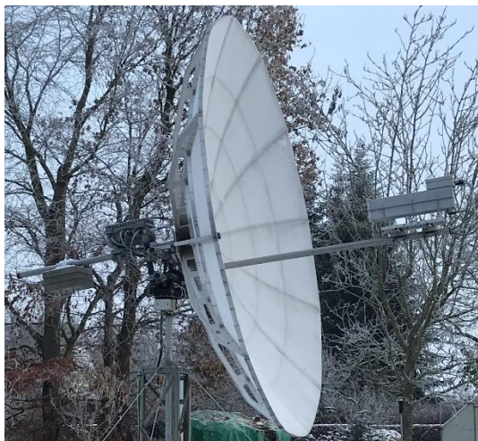
DL1SUZ's 3.2 m dish used on 23 and 13 cm

DL1SUZ: Uwe dl1suz@t-online.de made some 1296 EME SSB contacts during the SSB Funtest -- I QSO'd both DG5CST and OK2DL on SSB for a score 2 \times 2 \times 2 \times 100 = 800 points! I also made CW initials with SA6BUN, LZ1DX, DL6SH and IK1FJI. My rig is a 3.2 m dish and 300 W. I'm working to complete my equipment for 9 cm EME and hope to make the 9 cm Dubus Contest weekend on 4/5 March. I will start with 50 W and a DDK 0.5 dB NF LNA with my present dish.