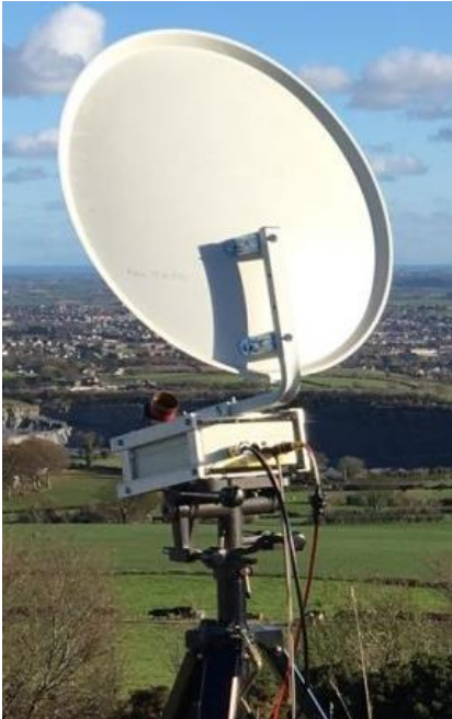
GI7UGV's 1.2 m tropo dish used on 3 cm EME

G4RFR assuming with my low power and lossy feed I would not be heard. Thus, I was extremely surprised when I got a response and completed my first 3 cm EME QSO with them! This was followed by initials with OK1KIR and OZ1LPR, confirming it wasn't some sort of fluke! I'm now putting together a more appropriate EME setup with more power and properly mounted on the dish. I will hopefully be fully operational in a couple of months and am looking forward to making many more contacts.