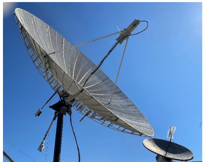
XE1XA's 5 m 30 year old dish still going strong – smaller dish used for space reception on microwaves