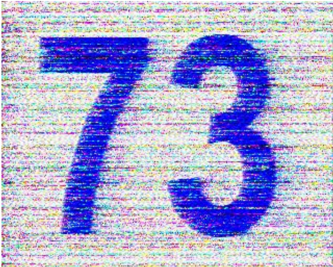
OK1TEH on SSTV as copied by PI9CAM